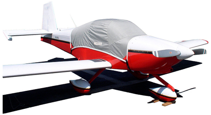
Van's RV-10 Canopy Cover