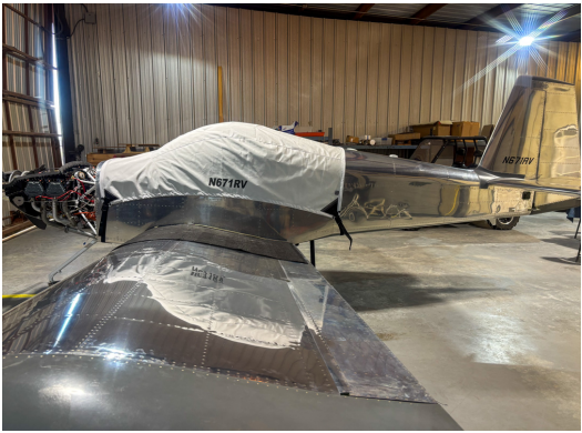
Van's RV-14A Canopy Cover