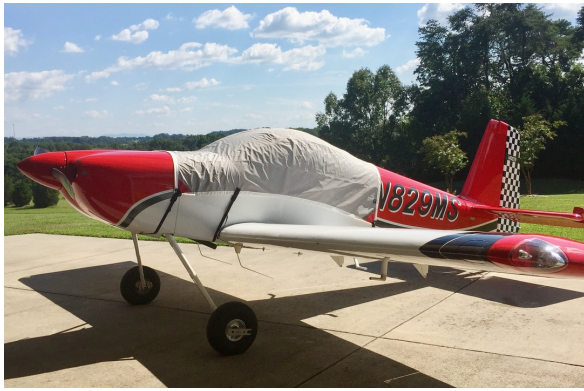
Van's Aircraft RV-14 Travel Cover