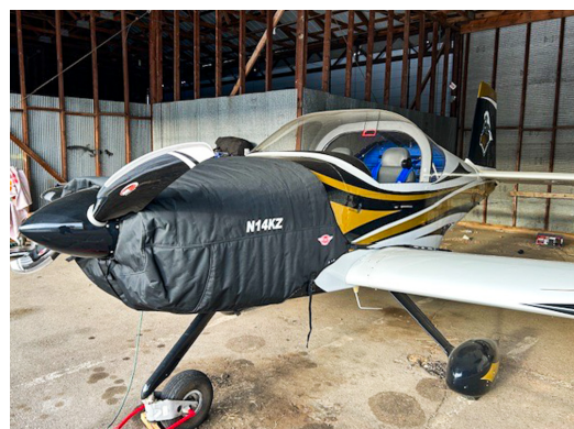
RV-14A Insulated Engine Cover