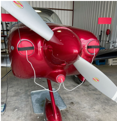
RV-14A Engine Inlet Plugs, Sam James Cowl