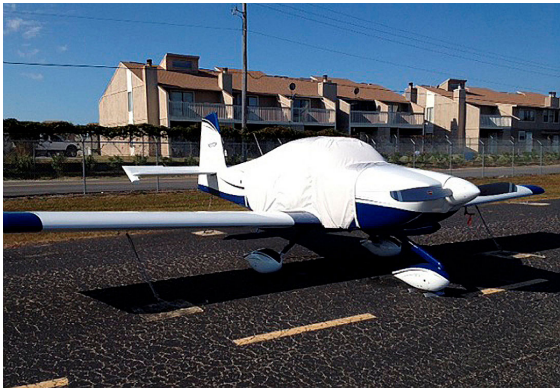
Van's RV-10 Extended Canopy Cover

This cover type is made from Silver Acrylic Sunbrella canvas and is 100% lined with a soft and smooth microfiber. Bruce's Custom Covers developed this material combination especially for aircraft protection. The outer material is medium weight and treated for water resistance, UV resistance and anti-static buildup. The inner lining is a very soft and smooth microfiber to prevent scratching. The material is very reflective, and tests show that the cabin interior temperature can be reduced to near-ambient temperature on the hottest of days. It is water, ice and snow repellent, yet breathable to allow moisture to escape from between the cover and the aircraft surface.