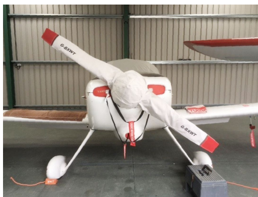
Van's RV-6 Prop/Spinner Cover

This cover type is made from Silver Acrylic Sunbrella canvas and is 100% lined with a soft and smooth microfiber. Bruce's Custom Covers developed this material combination especially for aircraft protection. The outer material is medium weight and treated for water resistance, UV resistance and anti-static buildup. The inner lining is a very soft and smooth microfiber to prevent scratching. The material is very reflective, and tests show that the cabin interior temperature can be reduced to near-ambient temperature on the hottest of days. It is water, ice and snow repellent, yet breathable to allow moisture to escape from between the cover and the aircraft surface.