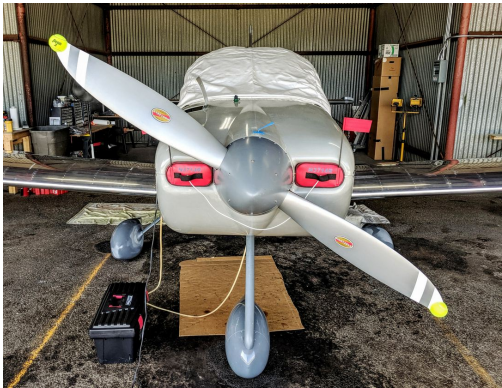
Van's RV-14A Engine Inlet Plugs

Engine Inlet Plugs are custom fit for your Van's Aircraft RV-14 intakes, made with heavy-duty vinyl material, and stuffed with a single block of sculpted urethane foam. Each plug has a zipper that allows the foam to be removed and dried if necessary. Engine plugs have warning flags that are visible from the cockpit or 'remove before flight' streamers sewn onto the face of the plugs. Most plugs are imprinted with the aircraft registration number in black for an extra charge. Storage bag NOT included. Engine plugs may be inserted after flight when the engine is still warm. Engine Inlet Plugs are commonly referred to as Cowl Plugs, Intake Plugs, Cowl Blocks, Engine Blocks, and Engine Bungs.