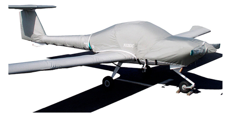
DA-20 Full Cover Set