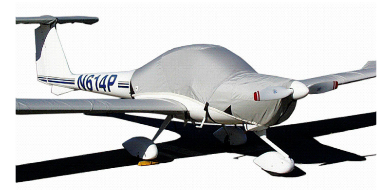
DA-20 Canopy/Engine, Prop/Spinner, Wing, Tailboom, Horiz. Stab. Covers