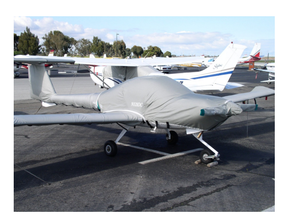
DA-20 Full Cover Set