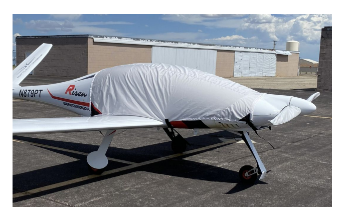
Swiss Excellence Risen 914 Canopy Cover