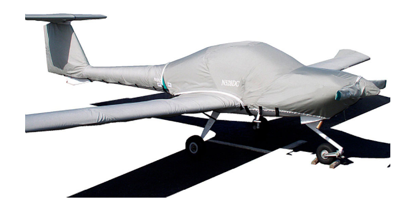
DA-20 Full Cover Set

This cover type is made from Silver Acrylic Sunbrella canvas and is 100% lined with a soft and smooth microfiber. Bruce's Custom Covers developed this material combination especially for aircraft protection. The outer material is medium weight and treated for water resistance, UV resistance and anti-static buildup. The inner lining is a very soft and smooth microfiber to prevent scratching. The material is very reflective, and tests show that the cabin interior temperature can be reduced to near-ambient temperature on the hottest of days. It is water, ice and snow repellent, yet breathable to allow moisture to escape from between the cover and the aircraft surface.