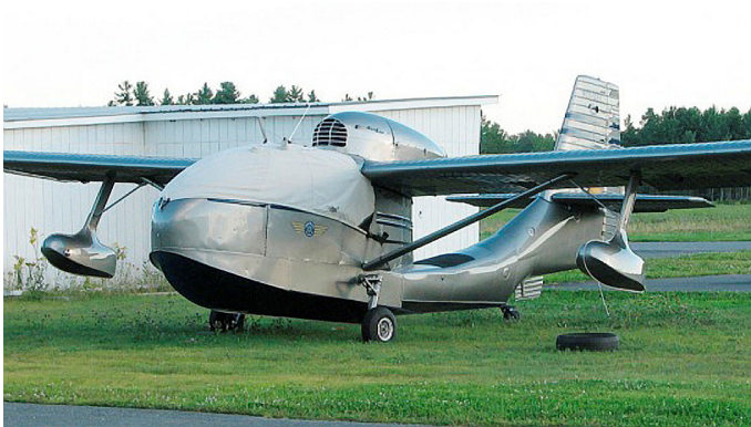
Seabee Canopy Cover