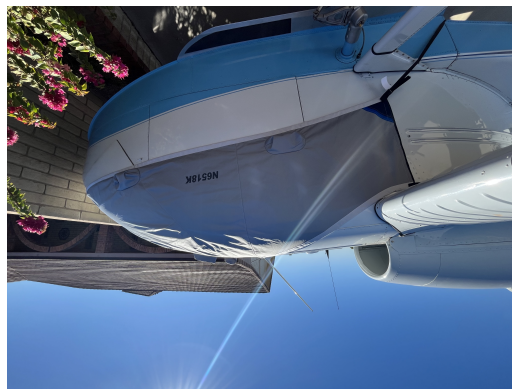
Seabee Amphibian Travel Cover, Light Weight Canopy Cover