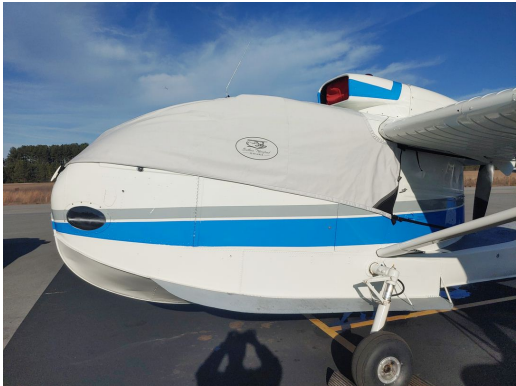
Republic Seabee Canopy Cover

The material is very reflective, and tests show that the cabin interior temperature can be reduced to near-ambient temperature on the hottest of days. It is water, ice and snow repellent, yet breathable to allow moisture to escape from between the cover and the aircraft surface.