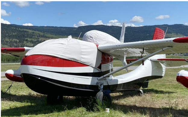
Republic Seabee Canopy, Engine, Prop Cover (5-blade)