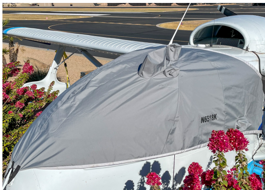
Seabee Amphibian Travel Cover, Light Weight Canopy Cover

This cover type is made from Silver Acrylic Sunbrella canvas and is 100% lined with a soft and smooth microfiber. Bruce's Custom Covers developed this material combination especially for aircraft protection. The outer material is medium weight and treated for water resistance, UV resistance and anti-static buildup. The inner lining is a very soft and smooth microfiber to prevent scratching. The material is very reflective, and tests show that the cabin interior temperature can be reduced to near-ambient temperature on the hottest of days. It is water, ice and snow repellent, yet breathable to allow moisture to escape from between the cover and the aircraft surface.