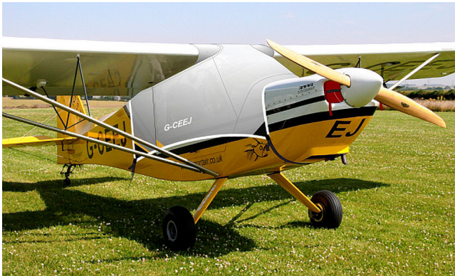
Rans Canopy Cover & Engine Plugs (illustration on a Rans S-7)