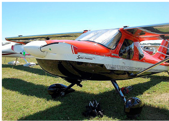
Glstar Sportsman Windshield HeatShield