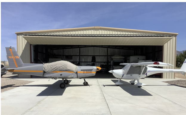
G-3/600 Travel Cover and Zlin 142 Canopy Cover

Travel Covers are made with Silver Solution-Dyed Polyester fabric and only lined over the windshield to save weight. The material is lightweight and more compact for easy stowage in the aircraft. The polyester material is water resistant, but only intended for occasional use outside. We also have an ultra lightweight material available for fitted hangar dust covers. For daily outdoor use, the non-travel Sunbrella Cover is the best choice.