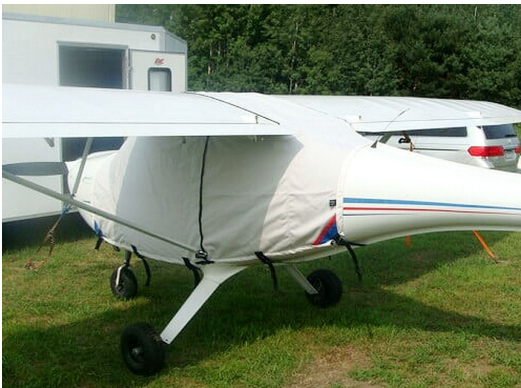
Remos G3 & GX MODELS Extended Canopy Cover (Over-The-Top Style)

This cover type is made from Silver Acrylic Sunbrella canvas and is 100% lined with a soft and smooth microfiber. Bruce's Custom Covers developed this material combination especially for aircraft protection. The outer material is medium weight and treated for water resistance, UV resistance and anti-static buildup. The inner lining is a very soft and smooth microfiber to prevent scratching. The material is very reflective, and tests show that the cabin interior temperature can be reduced to near-ambient temperature on the hottest of days. It is water, ice and snow repellent, yet breathable to allow moisture to escape from between the cover and the aircraft surface.