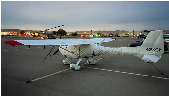
Remos RG-3 Complete Cover Set

WINTER USE MATERIAL - Made with Solution-Dyed Polyester fabric, this option is intended for seasonal use to aid in deicing, rain mitigation, or for occasional travel. The material is lighter and more compact, but more susceptible to UV damage and may have a shorter useful life if used continuously outside than the all-year use material.