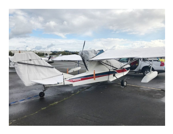
Searey Tail Covers, Engine Cover, Wing Covers