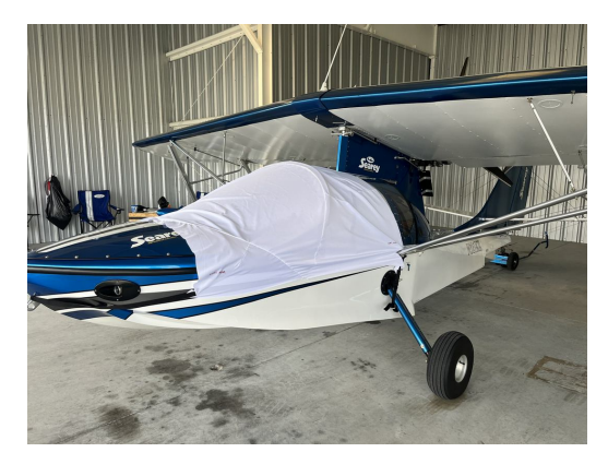
SeaRey Cockpit ONLY Cover, test fit cover