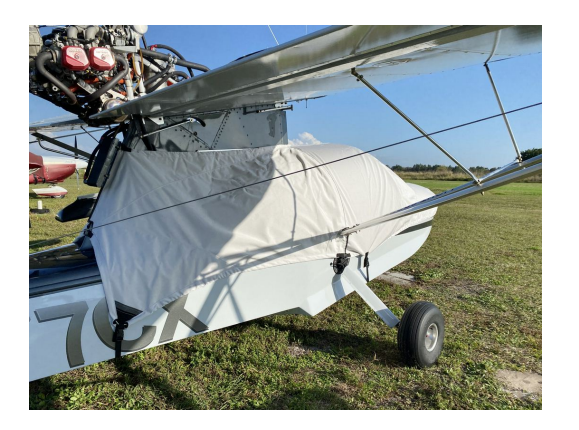
SeaRey Canopy/Nose Cover