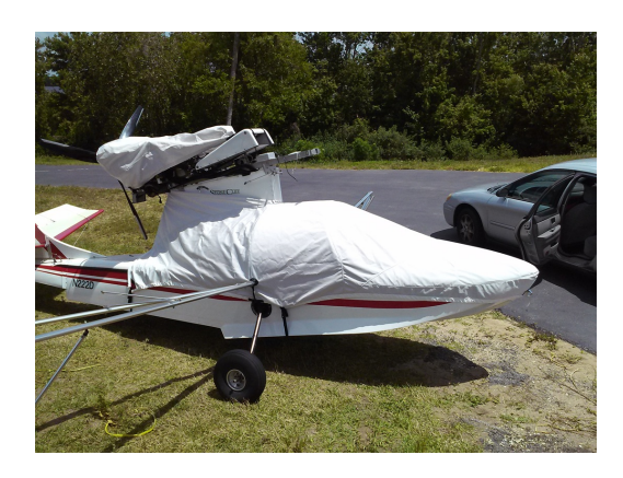
SeaRey Canopy/Nose Cover