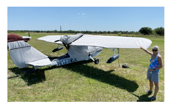
Searey Complete Cover Set