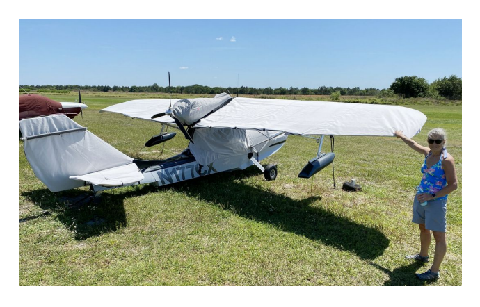
Searey Complete Cover Set