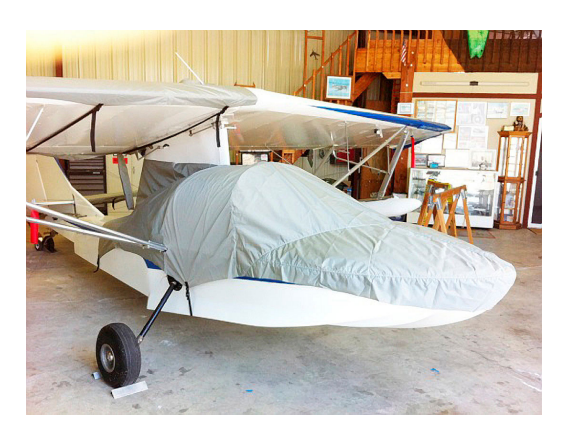
SeaRey Canopy Cover (test fit cover)