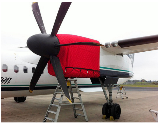
Dash 8-Q400 Insulated Engine Cover