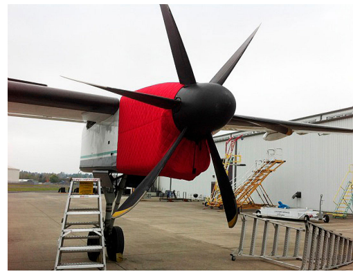
Dash 8-Q400 Insulated Engine Cover