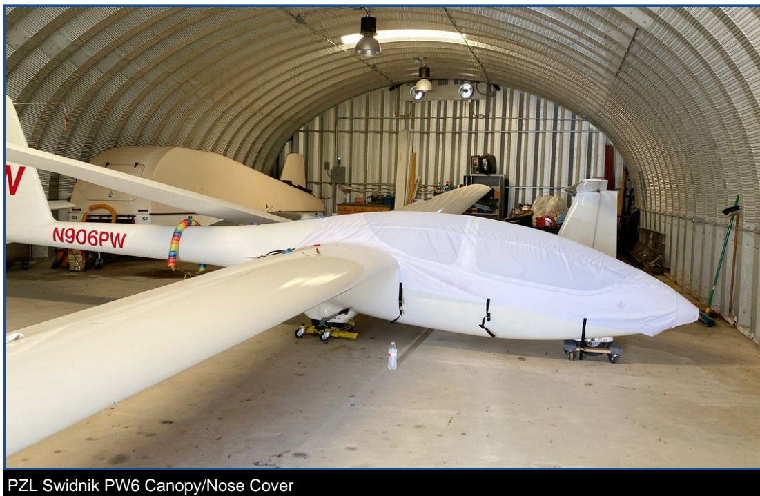
PZL Swidnik PW6 Canopy/Nose Cover