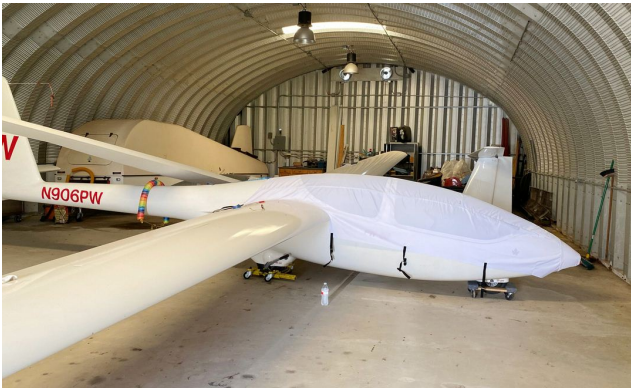
PZL Swidnik PW6 Canopy/Nose Cover