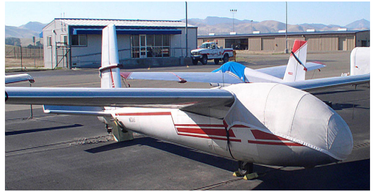
Blanik L13 Canopy/Nose Cover