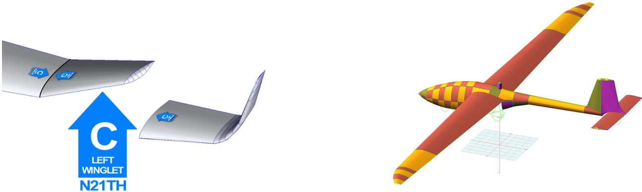
Sailplane Full Cover Set Graphic Indicators (Discus 2B, 3D model) PZL Swidnik PW-5 Canopy/Nose, Wing & Empennage Covers, 3D model

WINTER USE MATERIAL - Made with Solution-Dyed Polyester fabric, this option is intended for seasonal use to aid in deicing, rain mitigation, or for occasional travel. The material is lighter and more compact, but more susceptible to UV damage and may have a shorter useful life if used continuously outside than the all-year use material.