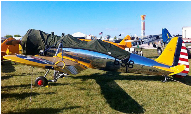
Ryan PT-22 ST3KR Canopy Cover and Engine Cover