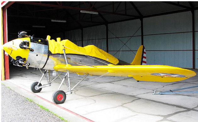
Ryan PT22 Canopy Cover

This cover type is made from Silver Acrylic Sunbrella canvas and is 100% lined with a soft and smooth microfiber. Bruce's Custom Covers developed this material combination especially for aircraft protection. The outer material is medium weight and treated for water resistance, UV resistance and anti-static buildup. The inner lining is a very soft and smooth microfiber to prevent scratching. The material is very reflective, and tests show that the cabin interior temperature can be reduced to near-ambient temperature on the hottest of days. It is water, ice and snow repellent, yet breathable to allow moisture to escape from between the cover and the aircraft surface.