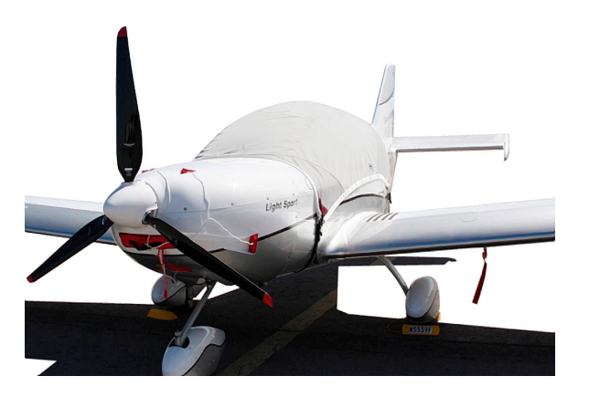
Sportcruiser Canopy Cover & Plugs

have warning flags that are visible from the cockpit or 'remove before flight' streamers sewn onto the face of the plugs. Most plugs are imprinted with the aircraft registration number in black for an extra charge. Storage bag NOT included. Engine plugs may be inserted after flight when the engine is still warm. Engine Inlet Plugs are commonly referred to as Cowl Plugs, Intake Plugs, Cowl Blocks, Engine Blocks, and Engine Bungs.