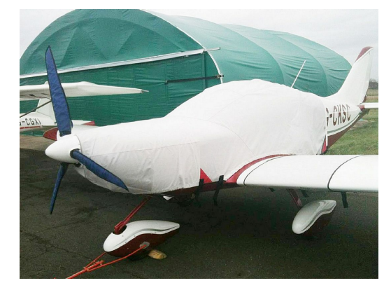
PiperSport Canopy/Engine Cover, Wing Locker Covers