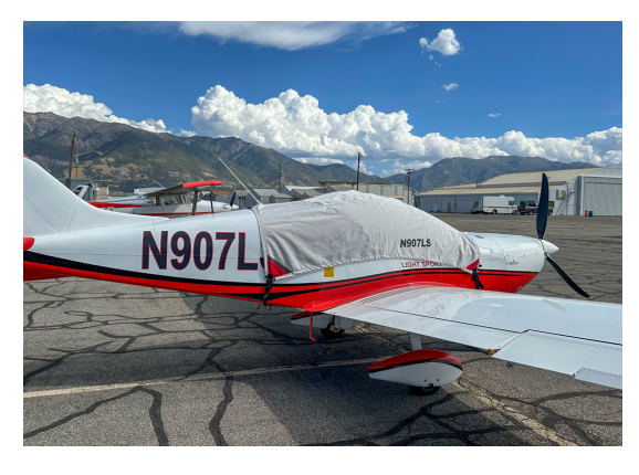
Piper PiperSport Canopy Cover

This cover type is made from Silver Acrylic Sunbrella canvas and is 100% lined with a soft and smooth microfiber. Bruce's Custom Covers developed this material combination especially for aircraft protection. The outer material is medium weight and treated for water resistance, UV resistance and anti-static buildup. The inner lining is a very soft and smooth microfiber to prevent scratching. The material is very reflective, and tests show that the cabin interior temperature can be reduced to near-ambient temperature on the hottest of days. It is water, ice and snow repellent, yet breathable to allow moisture to escape from between the cover and the aircraft surface.