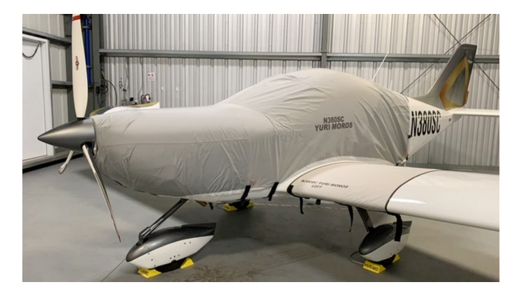
Czech Sport Travel Light Weight Canopy/Engine Cover, Wing Locker Covers

WINTER USE MATERIAL - Made with Solution-Dyed Polyester fabric, this option is intended for seasonal use to aid in deicing, rain mitigation, or for occasional travel. The material is lighter and more compact, but more susceptible to UV damage and may have a shorter useful life if used continuously outside than the all-year use material.