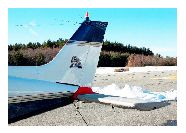
Tailcone & Horizontal Stabilizer Covers