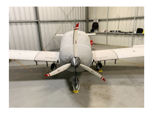
Czech Sport Travel Light Weight Canopy/Engine Cover, Wing Locker Covers