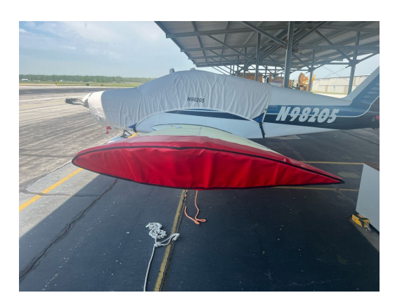
Piper PA-28-140 Wingtip Pads