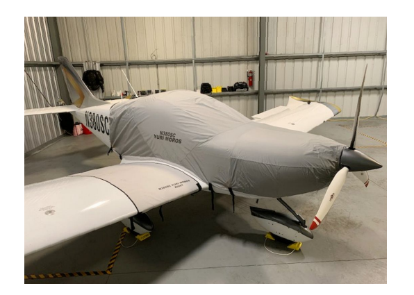
Czech Sport Travel Light Weight Canopy/Engine Cover, Wing Locker Covers

Travel Covers are made with Silver Solution-Dyed Polyester fabric and only lined over the windshield to save weight. The material is lightweight and more compact for easy stowage in the aircraft. The polyester material is water resistant, but only intended for occasional use outside. We also have an ultra lightweight material available for fitted hangar dust covers. For daily outdoor use, the non-travel Sunbrella Cover is the best choice.