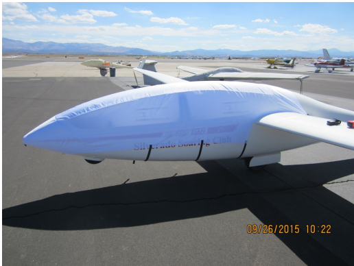
DG-505 Canopy/Nose Cover (test fit cover)