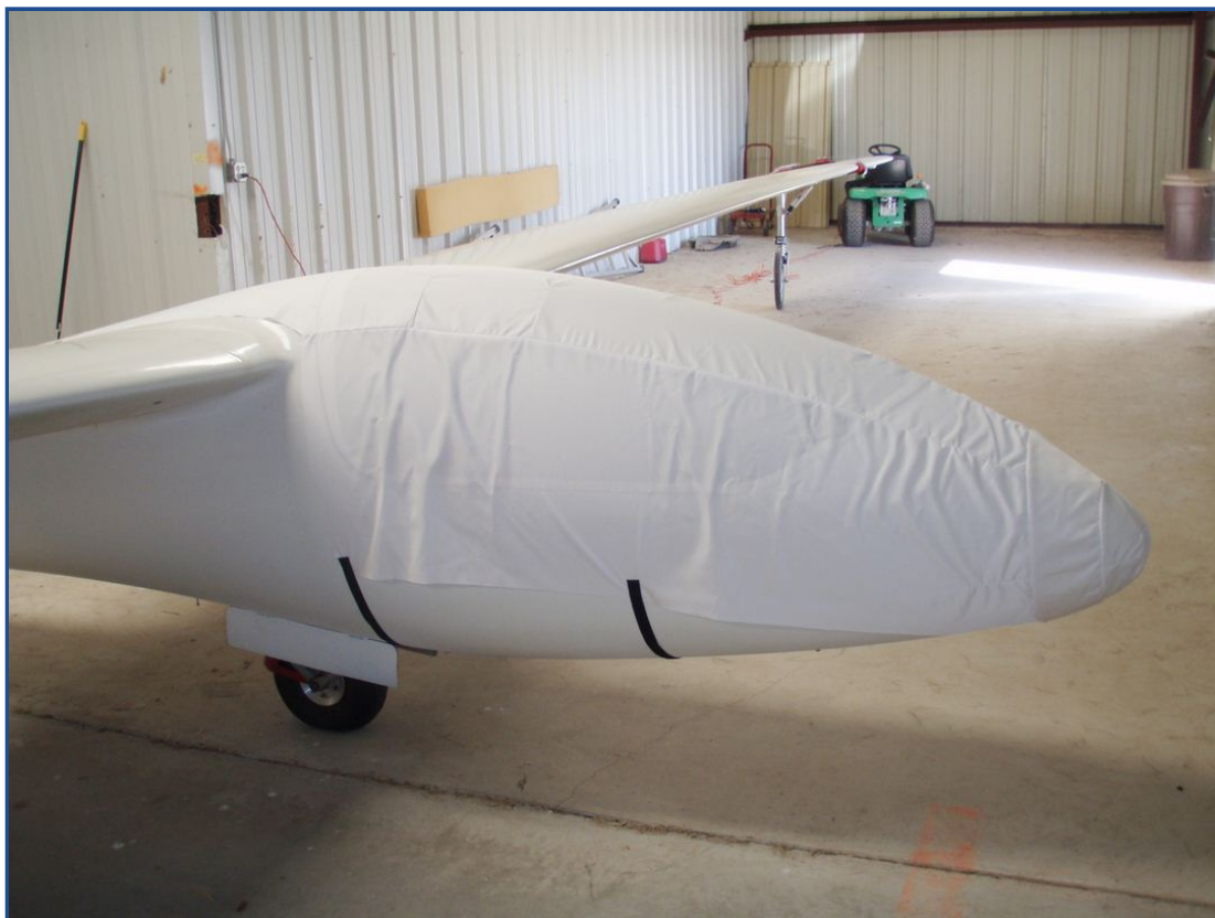
Bolkow Phoebus C-1 Canopy/Nose Cover, test fit cover