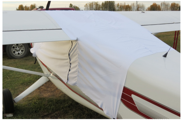
Pelican Canopy Cover (test fit cover)