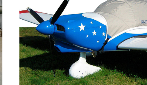
Pazmany PL2 Homebuilt Canopy Cover