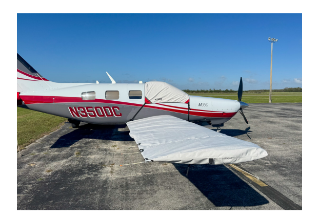
Piper PA 46-350P Cockpit & Wing Covers