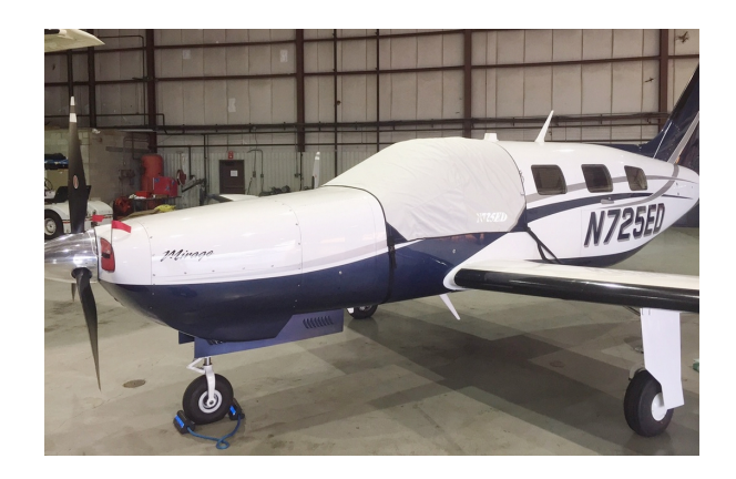
Piper Malibu/Mirage Cockpit Cover, Engine Plugs