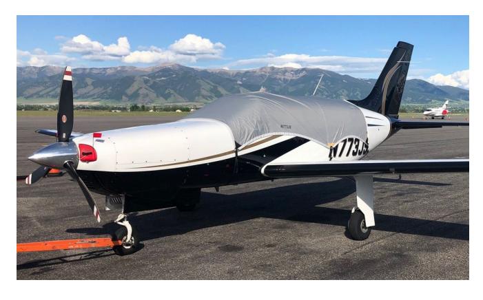
Piper PA46-350P Travel Canopy Cover, Engine Plugs