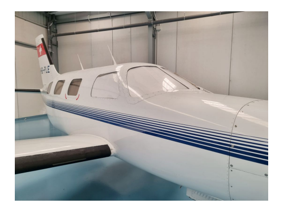
Piper PA-46 Malibu Cockpit Heatshields