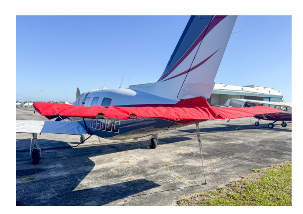
Piper PA 46-350P Horizontal Stabilizer/Tailcone Cover

WINTER USE MATERIAL - Made with Solution-Dyed Polyester fabric, this option is intended for seasonal use to aid in deicing, rain mitigation, or for occasional travel. The material is lighter and more compact, but more susceptible to UV damage and may have a shorter useful life if used continuously outside than the all-year use material.