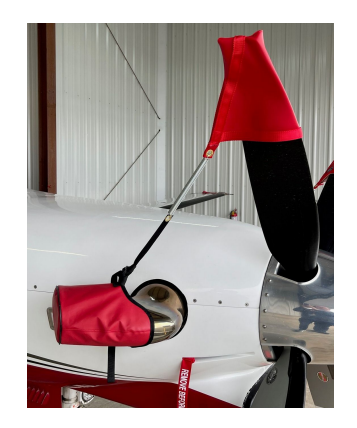
Piper Malibu JetProp Prop Tie & Exhaust Cover