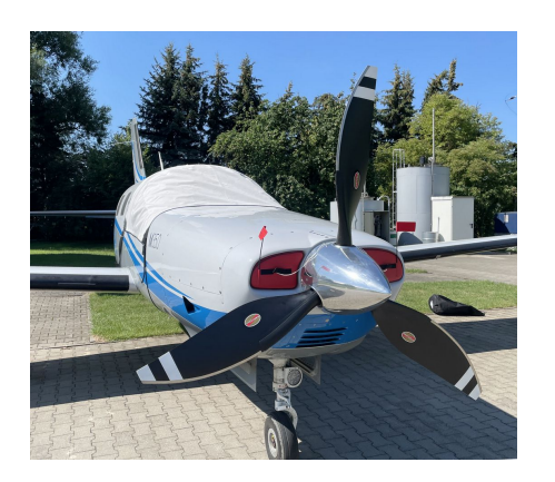
Piper PA-46-350P Cockpit Cover, Engine Plugs