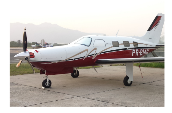
Piper Malibu/Mirage Engine Plugs, Cockpit HeatShields

window framing. It folds up flat and easily stores in the included storage sleeve. Some designs may require velcro and suction cups. A Heatshield is an excellent short-term remedy for cockpit overheating.