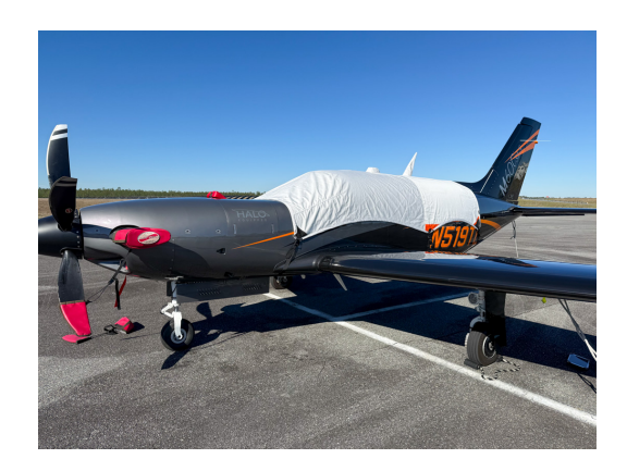
PA-46-600TP Canopy Cover

This cover type is made from Silver Acrylic Sunbrella canvas and is 100% lined with a soft and smooth microfiber. Bruce's Custom Covers developed this material combination especially for aircraft protection. The outer material is medium weight and treated for water resistance, UV resistance and anti-static buildup. The inner lining is a very soft and smooth microfiber to prevent scratching. The material is very reflective, and tests show that the cabin interior temperature can be reduced to near-ambient temperature on the hottest of days. It is water, ice and snow repellent, yet breathable to allow moisture to escape from between the cover and the aircraft surface.