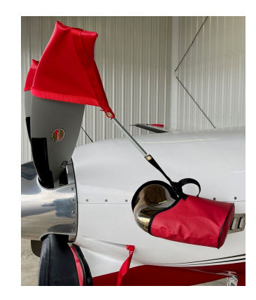
Piper Malibu JetProp Prop Tie & Exhaust Cover

This cover type is made from Silver Acrylic Sunbrella canvas and is 100% lined with a soft and smooth microfiber. Bruce's Custom Covers developed this material combination especially for aircraft protection. The outer material is medium weight and treated for water resistance, UV resistance and anti-static buildup. The inner lining is a very soft and smooth microfiber to prevent scratching. The material is very reflective, and tests show that the cabin interior temperature can be reduced to near-ambient temperature on the hottest of days. It is water, ice and snow repellent, yet breathable to allow moisture to escape from between the cover and the aircraft surface.