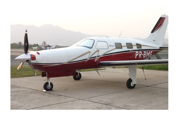
Piper Malibu/Mirage Engine Plugs, Cockpit HeatShields