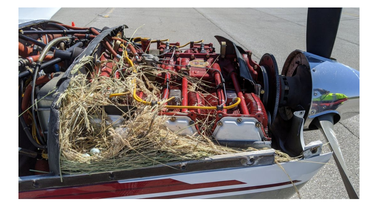
Piper Seminole Engine Plugs