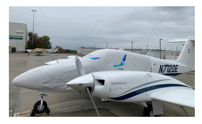
Piper PA-44 Seminole Canopy/Nose Cover with custom artwork