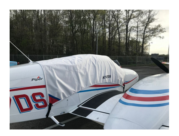
Piper Seminole Canopy Cover