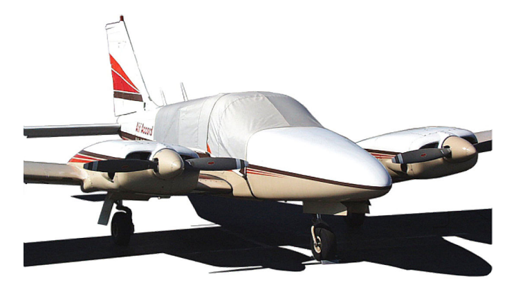
Piper Seneca PA-34 Canopy Cover

Travel Covers are made with Silver Solution-Dyed Polyester fabric and only lined over the windshield to save weight. The material is lightweight and more compact for easy stowage in the aircraft. The polyester material is water resistant, but only intended for occasional use outside. We also have an ultra lightweight material available for fitted hangar dust covers. For daily outdoor use, the non-travel Sunbrella Cover is the best choice.