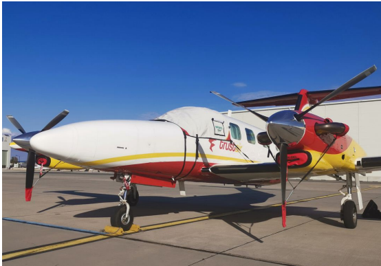
Piper PA-42 Cheyenne III Engine Plugs, Prop Ties, Cockpit Cover