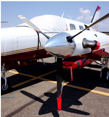
Piper Cheyenne Cockpit Cover, Engine Plugs, Prop Tie/Exhaust Covers