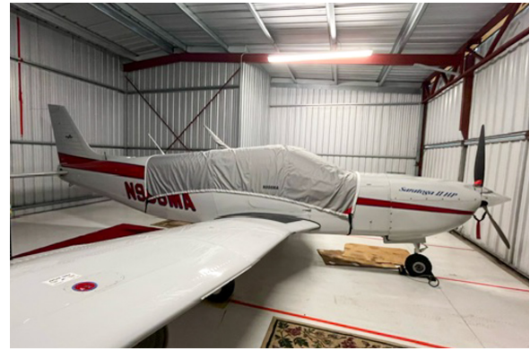
Piper PA-32 Saratoga, Cherokee 6, Lance Travel Cover, Light Weight Canopy Cover