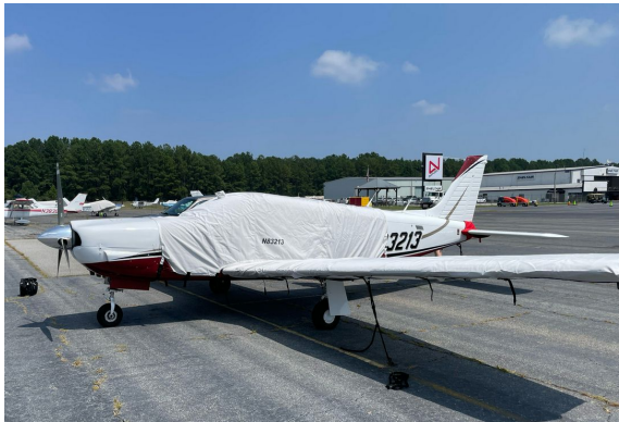
Piper PA-32R-301 Extended Canopy Cover, Wing & Tailcone Covers