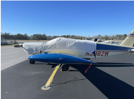
Piper PA-32-260 Canopy/Engine Cover