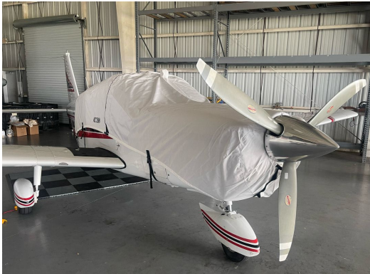
Piper Cherokee Six Canopy/Engine Cover

This cover type is made from Silver Acrylic Sunbrella canvas and is 100% lined with a soft and smooth microfiber. Bruce's Custom Covers developed this material combination especially for aircraft protection. The outer material is medium weight and treated for water resistance, UV resistance and anti-static buildup. The inner lining is a very soft and smooth microfiber to prevent scratching. The material is very reflective, and tests show that the cabin interior temperature can be reduced to near-ambient temperature on the hottest of days. It is water, ice and snow repellent, yet breathable to allow moisture to escape from between the cover and the aircraft surface.