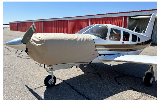
Piper PA-32 Saratoga Engine Cover