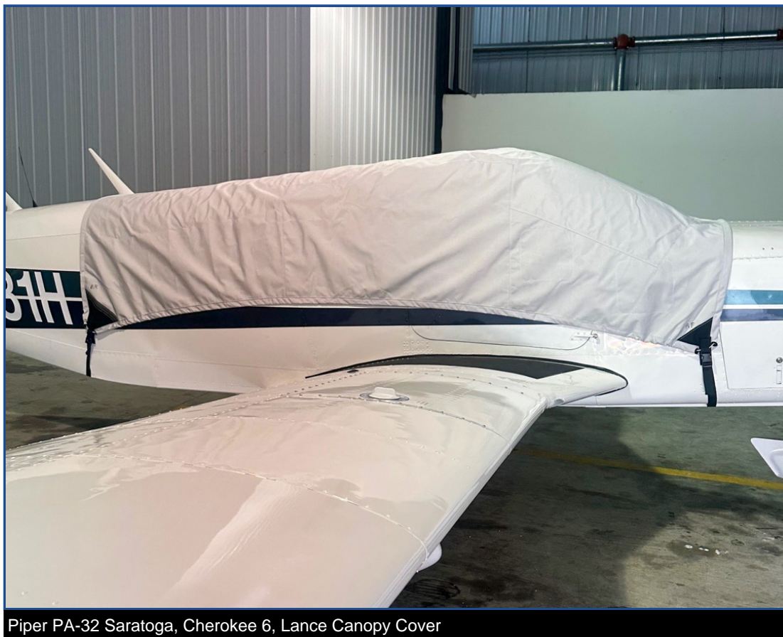
Piper PA-32 Saratoga, Cherokee 6, Lance Canopy Cover