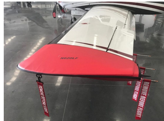
Piper Meridian Wingtip Pads, M600 Models