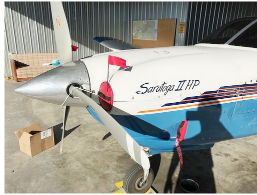
Piper PA-32 (Late Models, Round Type) and Cowling Scoop Plug PA32-125