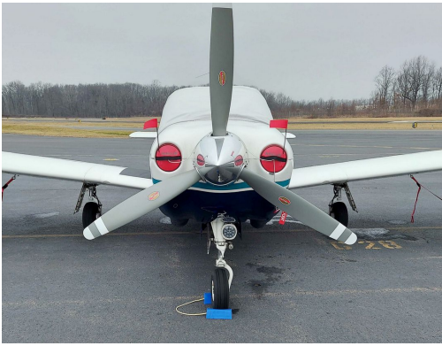
Piper PA-32R-301 Engine Plugs