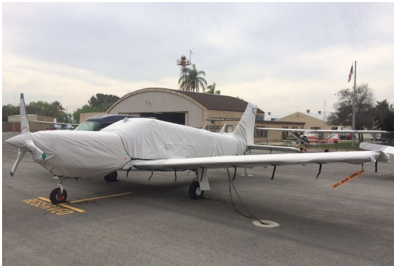
Piper Saratoga Cover Set

WINTER USE MATERIAL - Made with Solution-Dyed Polyester fabric, this option is intended for seasonal use to aid in deicing, rain mitigation, or for occasional travel. The material is lighter and more compact, but more susceptible to UV damage and may have a shorter useful life if used continuously outside than the all-year use material.