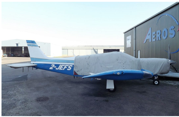
Piper PA-32R-301T Extended Canopy, Engine, Horiz. Stabilizer Covers