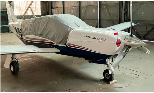
Piper Saratoga PA-32R-301T Travel Canopy Cover, Intake Plugs