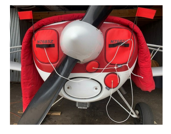
Piper PA-25 Pawnee Engine Plugs