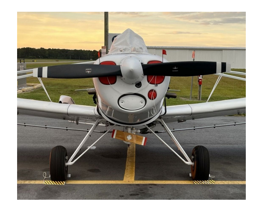
Piper PA-25 Pawnee Canopy/Hopper Cover

Engine Inlet Plugs are custom fit for your Piper Pawnee PA-25 intakes, made with heavy-duty vinyl material, and stuffed with a single block of sculpted urethane foam. Each plug has a zipper that allows the foam to be removed and dried if necessary. Engine plugs have warning flags that are visible from the cockpit or 'remove before flight' streamers sewn onto the face of the plugs. Most plugs are imprinted with the aircraft registration number in black for an extra charge. Storage bag NOT included. Engine plugs may be inserted after flight when the engine is still warm. Engine Inlet Plugs are commonly referred to as Cowl Plugs, Intake Plugs, Cowl Blocks, Engine Blocks, and Engine Bungs.