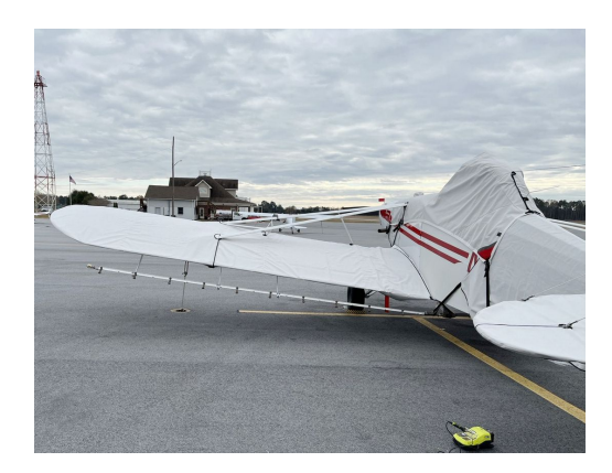
Piper PA-25 Pawnee Cover Set

WINTER USE MATERIAL - Made with Solution-Dyed Polyester fabric, this option is intended for seasonal use to aid in deicing, rain mitigation, or for occasional travel. The material is lighter and more compact, but more susceptible to UV damage and may have a shorter useful life if used continuously outside than the all-year use material.