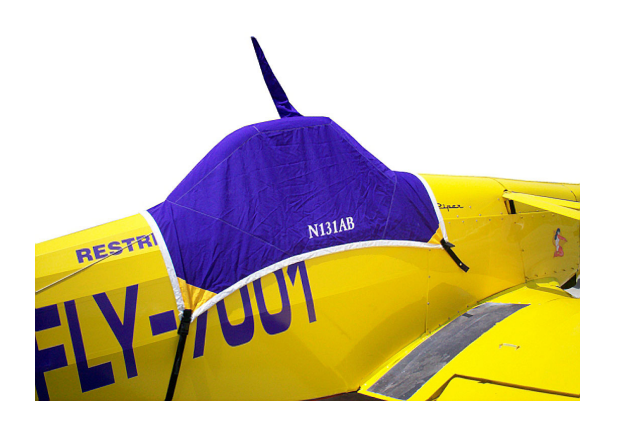
Piper Pawnee Canopy Cover