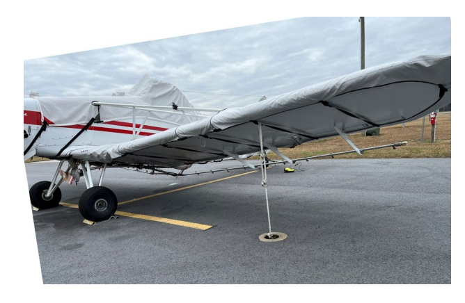
Piper PA-25 Pawnee Cover Set