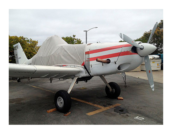
Piper Brave PA-36 Canopy/Hopper Cover

occasional use outside. We also have an ultra lightweight material available for fitted hangar dust covers. For daily outdoor use, the non-travel Sunbrella Cover is the best choice.