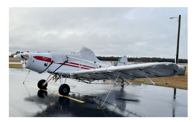
Piper Pawnee Canopy/Hopper, Wing & Empennage Covers