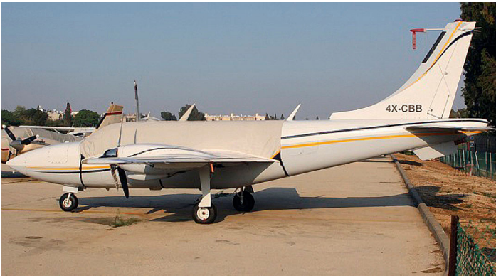
Piper Aerostar Canopy Cover