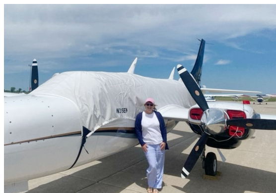
Piper PA-601 Aerostar