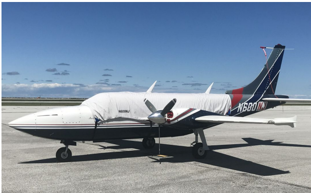
Smith Aerostar 600 Canopy Cover