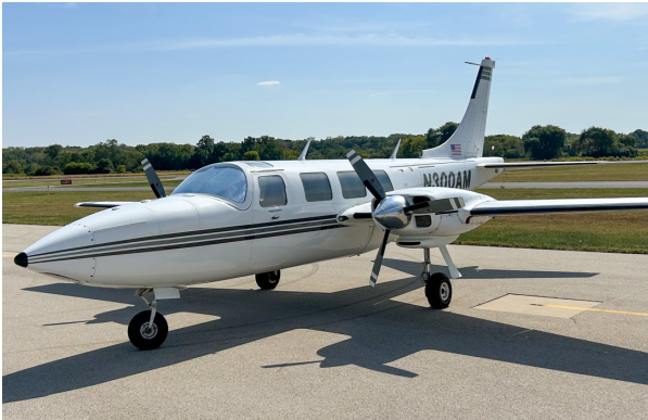
Aerostar 601P Windshield Heatshield

Windshield Heatshields are interior sunshades for an aircraft's front windshield. The product is a unique composite of closed-cell foam with a silver mylar finish. The semi-rigid design is stiff enough to stand along the inside of the windshield using sun visors or window framing. It folds up flat and easily stores in the included storage sleeve. Some designs may require velcro and suction cups or split right and left sides. A Heatshield is an excellent short-term remedy for cockpit overheating. An external fabric cover is far more effective and practical for long-term protection.