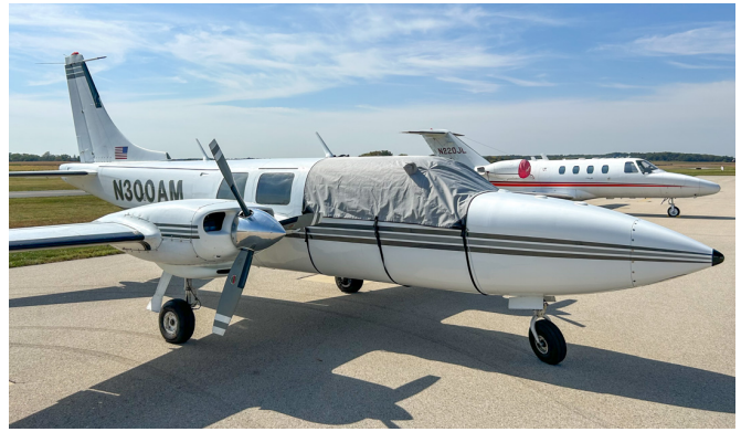
AEROSTAR 601P Travel Cover, Light Weight Travel Cockpit/Skylights Cover