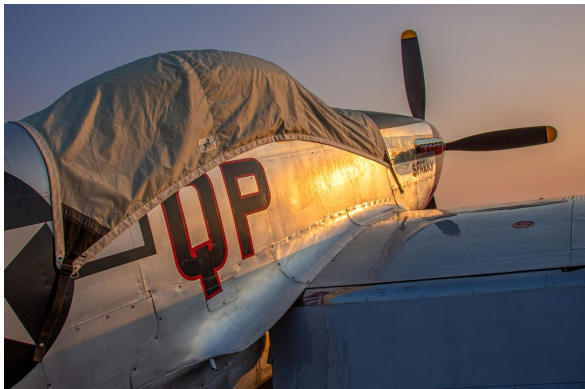
North American P51 Canopy Cover, 2022 Reno Air Races

This cover type is made from Silver Acrylic Sunbrella canvas and is 100% lined with a soft and smooth microfiber. Bruce's Custom Covers developed this material combination especially for aircraft protection. The outer material is medium weight and treated for water resistance, UV resistance and anti-static buildup. The inner lining is a very soft and smooth microfiber to prevent scratching. The material is very reflective, and tests show that the cabin interior temperature can be reduced to near-ambient temperature on the hottest of days. It is water, ice and snow repellent, yet breathable to allow moisture to escape from between the cover and the aircraft surface.