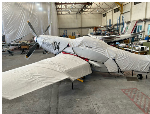
North American Mustang P51 Engine Cover