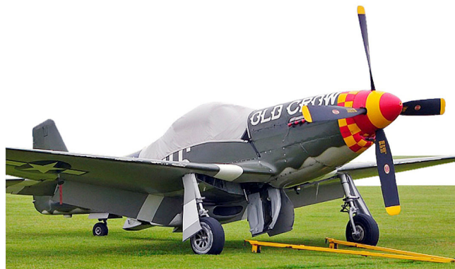
Canopy Cover, Chin Scoop & Exhaust Plugs