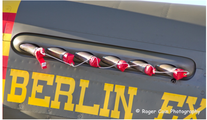
North American P-51 Exhaust Plugs