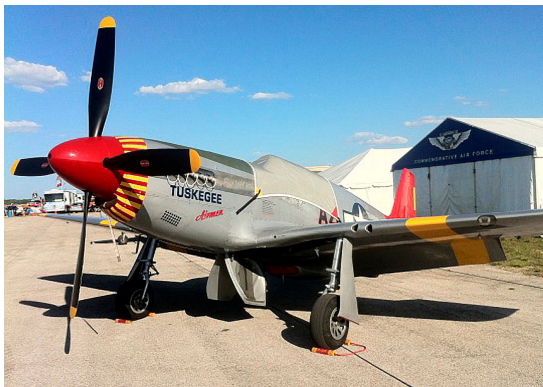
North American P51 Canopy Cover, Tuskegee Airmen model

Travel Covers are made with Silver Solution-Dyed Polyester fabric and only lined over the windshield to save weight. The material is lightweight and more compact for easy stowage in the aircraft. The polyester material is water resistant, but only intended for occasional use outside. We also have an ultra lightweight material available for fitted hangar dust covers. For daily outdoor use, the non-travel Sunbrella Cover is the best choice.