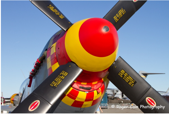
North American P-51 Chin Scoop Plug

Engine Inlet Plugs are custom fit for your North American Mustang P51 intakes, made with heavy-duty vinyl material, and stuffed with a single block of sculpted urethane foam. Each plug has a zipper that allows the foam to be removed and dried if necessary. Engine plugs have warning flags that are visible from the cockpit or 'remove before flight' streamers sewn onto the face of the plugs. Most plugs are imprinted with the aircraft registration number in black for an extra charge. Storage bag NOT included. Engine plugs may be inserted after flight when the engine is still warm. Engine Inlet Plugs are commonly referred to as Cowl Plugs, Intake Plugs, Cowl Blocks, Engine Blocks, and Engine Bungs.