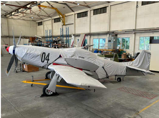
North American Mustang P51 Engine Cover

WINTER USE MATERIAL - Made with Solution-Dyed Polyester fabric, this option is intended for seasonal use to aid in deicing, rain mitigation, or for occasional travel. The material is lighter and more compact, but more susceptible to UV damage and may have a shorter useful life if used continuously outside than the all-year use material.