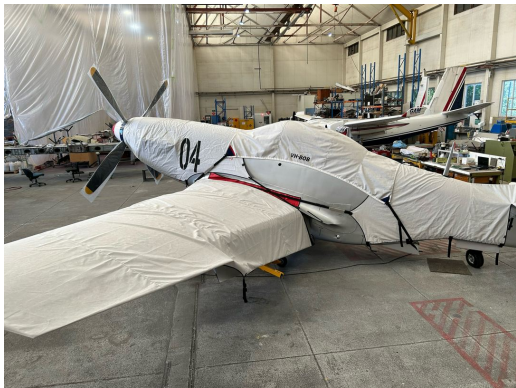
North American Mustang P51 Engine Cover