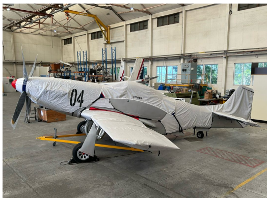
North American Mustang P51 Engine Cover

WINTER USE MATERIAL - Made with Solution-Dyed Polyester fabric, this option is intended for seasonal use to aid in deicing, rain mitigation, or for occasional travel. The material is lighter and more compact, but more susceptible to UV damage and may have a shorter useful life if used continuously outside than the all-year use material.