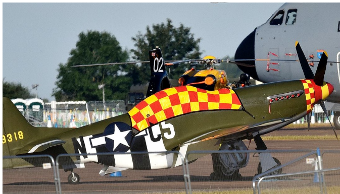
P-51 Canopy Cover, custom artwork & colors

This cover type is made from Silver Acrylic Sunbrella canvas and is 100% lined with a soft and smooth microfiber. Bruce's Custom Covers developed this material combination especially for aircraft protection. The outer material is medium weight and treated for water resistance, UV resistance and anti-static buildup. The inner lining is a very soft and smooth microfiber to prevent scratching. The material is very reflective, and tests show that the cabin interior temperature can be reduced to near-ambient temperature on the hottest of days. It is water, ice and snow repellent, yet breathable to allow moisture to escape from between the cover and the aircraft surface.