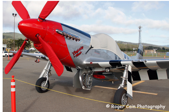
North American Mustang P51 Engine Cover