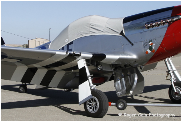
North American P-51 Canopy Cover

Engine Inlet Plugs are custom fit for your North American Mustang P51 intakes, made with heavy-duty vinyl material, and stuffed with a single block of sculpted urethane foam. Each plug has a zipper that allows the foam to be removed and dried if necessary. Engine plugs have warning flags that are visible from the cockpit or 'remove before flight' streamers sewn onto the face of the plugs. Most plugs are imprinted with the aircraft registration number in black for an extra charge. Storage bag NOT included. Engine plugs may be inserted after flight when the engine is still warm. Engine Inlet Plugs are commonly referred to as Cowl Plugs, Intake Plugs, Cowl Blocks, Engine Blocks, and Engine Bungs.