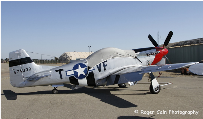
North American P-51 Canopy Cover

non-travel Sunbrella Cover is the best choice.