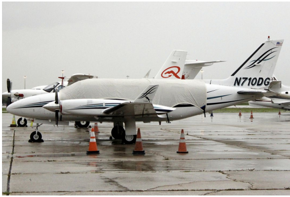
Piper Navajo Chieftain Canopy Cover