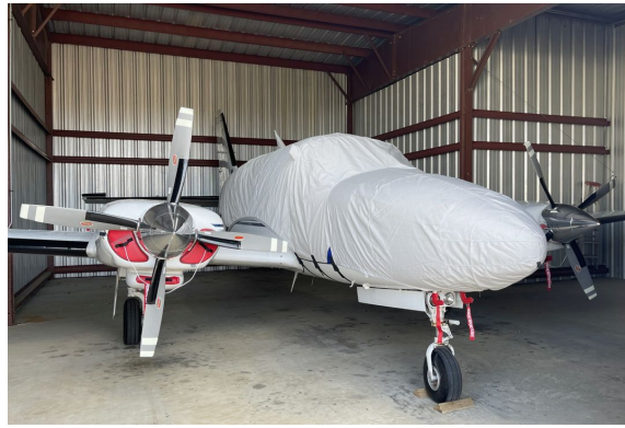
Piper Chieftain Canopy/Engine Cover, Engine Plugs, Pitot Covers