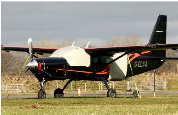
Cessna Caravan Cockpit Cover, Engine Plugs, Jump Door Cover