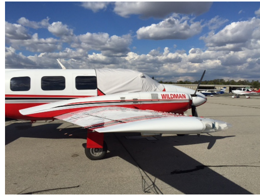
Piper Navajo Cockpit Cover, extended to cover emerg. door.