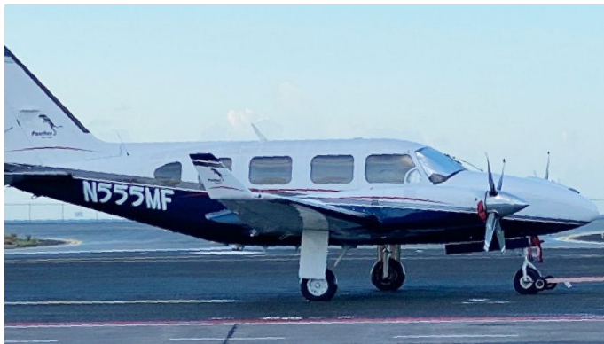
Piper Navajo Cockpit & Cabin HeatShields

Heatshields are interior sunshades for an aircraft's windows or canopy glass. The product is a unique composite of closed-cell foam with a silver mylar finish. The semi-rigid design is stiff enough to stand along the inside of the windshield using sun visors or window framing. It folds up flat and easily stores in the included storage sleeve. Some designs may require velcro and suction cups. A Heatshield is an excellent short-term remedy for cockpit overheating.