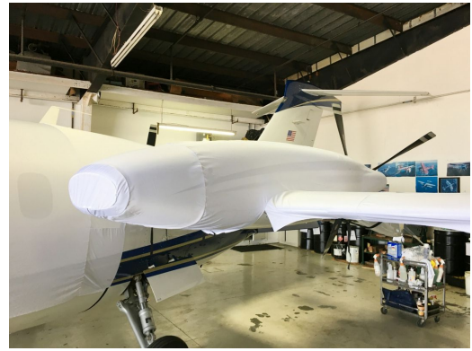
Piaggio P180 Fuselage/Canard Cover & Wing/Engine Covers (test fit covers)