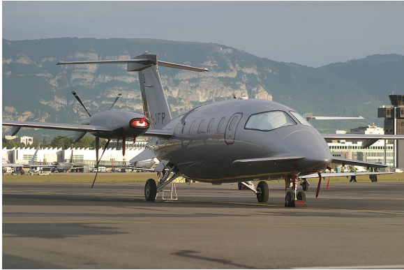
Piaggio 180 Cockpit HeatShields