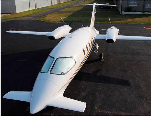
Piaggio 180 Cockpit HeatShields

Cockpit Heatshields are interior sunshades for the aircraft's cockpit. The product is a unique composite of closed-cell foam with a silver mylar finish. The semi-rigid design is stiff enough to stand inside the window framing. The set folds up flat and is easily stored in the included storage sleeve. Some designs may require velcro and suction cups. A Heatshield is an excellent short-term remedy for cockpit overheating, but an external fabric cover is more effective for long-term protection.