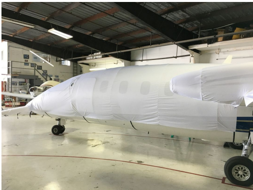
Piaggio P180 Fuselage/Canard Cover & Wing/Engine Covers (test fit covers)

WINTER USE MATERIAL - Made with Solution-Dyed Polyester fabric, this option is intended for seasonal use to aid in deicing, rain mitigation, or for occasional travel. The material is lighter and more compact, but more susceptible to UV damage and may have a shorter useful life if used continuously outside than the all-year use material.