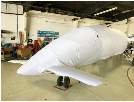
Piaggio P180 Fuselage/Canard Cover & Wing/Engine Covers (test fit covers)