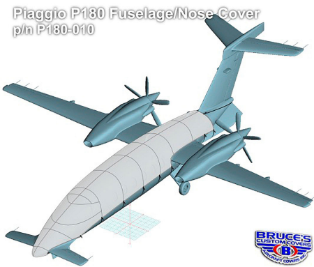
Piaggio 180 Fuselage/Nose Cover

Travel Covers are made with Silver Solution-Dyed Polyester fabric and only lined over the windshield to save weight. The material is lightweight and more compact for easy stowage in the aircraft. The polyester material is water resistant, but only intended for occasional use outside. We also have an ultra lightweight material available for fitted hangar dust covers. For daily outdoor use, the non-travel Sunbrella Cover is the best choice.