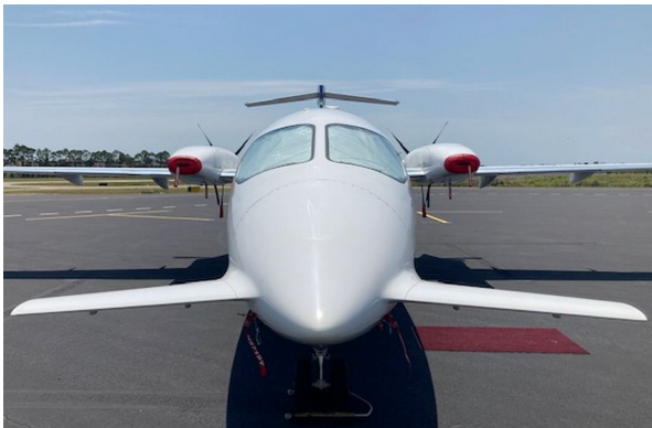
Piaggio P180 Cockpit HeatShields,

Engine Inlet Plugs are custom fit for your Piaggio Avanti P180 intakes, made with heavy-duty vinyl material, and stuffed with a single block of sculpted urethane foam. Each plug has a zipper that allows the foam to be removed and dried if necessary. Engine plugs have warning flags that are visible from the cockpit or 'remove before flight' streamers sewn onto the face of the plugs. Most plugs are imprinted with the aircraft registration number in black for an extra charge. Storage bag NOT included. Engine plugs may be inserted after flight when the engine is still warm. Engine Inlet Plugs are commonly referred to as Cowl Plugs, Intake Plugs, Cowl Blocks, Engine Blocks, and Engine Bungs.