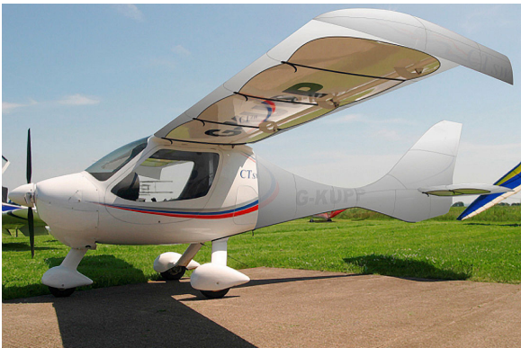
Wing Covers & Empennage Cover (illustration)