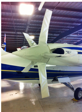
Piaggio 180 5-Blade Prop/Hub Cover

This cover type is made from Silver Acrylic Sunbrella canvas and is 100% lined with a soft and smooth microfiber. Bruce's Custom Covers developed this material combination especially for aircraft protection. The outer material is medium weight and treated for water resistance, UV resistance and anti-static buildup. The inner lining is a very soft and smooth microfiber to prevent scratching. The material is very reflective, and tests show that the cabin interior temperature can be reduced to near-ambient temperature on the hottest of days. It is water, ice and snow repellent, yet breathable to allow moisture to escape from between the cover and the aircraft surface.