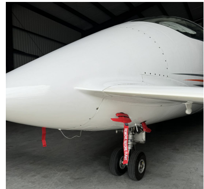
Piaggio P180 Pitot & Probe Covers