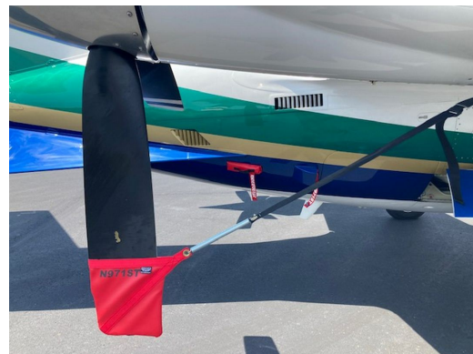
Piaggio P180 Prop Ties