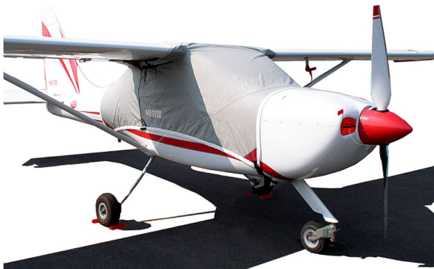
Glstar Over-Top Canopy Cover

This cover type is made from Silver Acrylic Sunbrella canvas and is 100% lined with a soft and smooth microfiber. Bruce's Custom Covers developed this material combination especially for aircraft protection. The outer material is medium weight and treated for water resistance, UV resistance and anti-static buildup. The inner lining is a very soft and smooth microfiber to prevent scratching. The material is very reflective, and tests show that the cabin interior temperature can be reduced to near-ambient temperature on the hottest of days. It is water, ice and snow repellent, yet breathable to allow moisture to escape from between the cover and the aircraft surface.