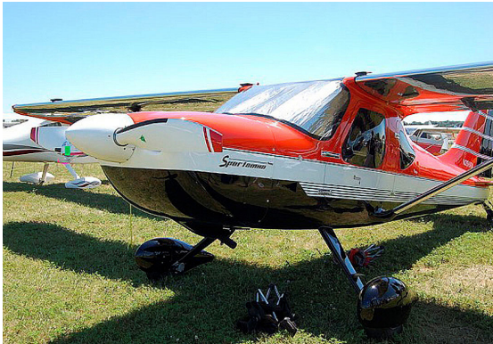
Glastar Sportsman Windshield HeatShield

Windshield Heatshields are interior sunshades for an aircraft's front windshield. The product is a unique composite of closed-cell foam with a silver mylar finish. The semi-rigid design is stiff enough to stand along the inside of the windshield using sun visors or window framing. It folds up flat and easily stores in the included storage sleeve. Some designs may require velcro and suction cups or split right and left sides. A Heatshield is an excellent short-term remedy for cockpit overheating. An external fabric cover is far more effective and practical for long-term protection.