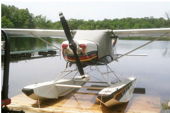
Glstar Sportsman Canopy Cover and Engine Plugs

Engine Inlet Plugs are custom fit for your OMF Symphony 160 intakes, made with heavy-duty vinyl material, and stuffed with a single block of sculpted urethane foam. Each plug has a zipper that allows the foam to be removed and dried if necessary. Engine plugs have warning flags that are visible from the cockpit or 'remove before flight' streamers sewn onto the face of the plugs. Most plugs are imprinted with the aircraft registration number in black for an extra charge. Storage bag NOT included. Engine plugs may be inserted after flight when the engine is still warm. Engine Inlet Plugs are commonly referred to as Cowl Plugs, Intake Plugs, Cowl Blocks, Engine Blocks, and Engine Bungs.