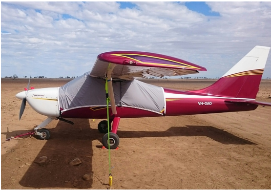
Glstar Sportsman Light Weight Travel Cover