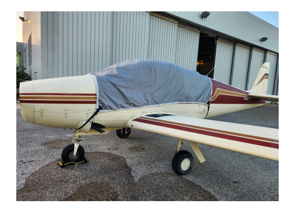
Navion Rangemaster Travel Cover, Light Weight Canopy Cover, Navion Rangemaster Travel Cover, Light Weight Canopy Cover, (Super Slope windshield) (Super Slope windshield)