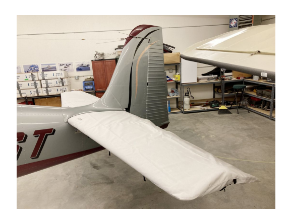
Navion Rangemaster Horizontal Stabilizer Covers

mitigation, or for occasional travel. The material is lighter and more compact, but more susceptible to UV damage and may have a shorter useful life if used continuously outside than the all-year use material.