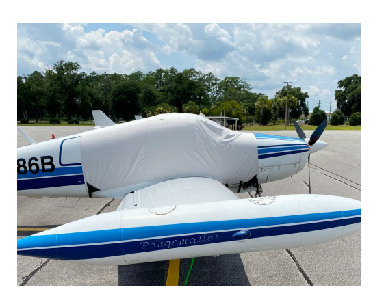
Navion Rangemaster Extended Canopy Cover