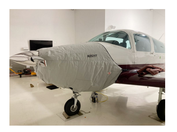
NAVION H Insulated Engine Cover