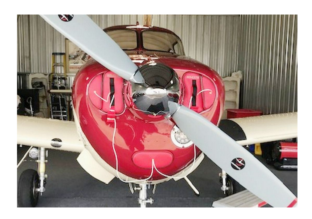
Ryan Navion B Engine Inlet Plugs