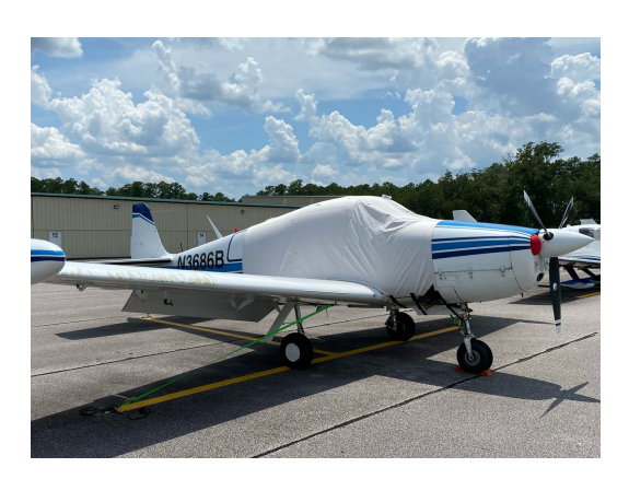
Navion Rangemaster Extended Canopy Cover

This cover type is made from Silver Acrylic Sunbrella canvas and is 100% lined with a soft and smooth microfiber. Bruce's Custom Covers developed this material combination especially for aircraft protection. The outer material is medium weight and treated for water resistance, UV resistance and anti-static buildup. The inner lining is a very soft and smooth microfiber to prevent scratching. The material is very reflective, and tests show that the cabin interior temperature can be reduced to near-ambient temperature on the hottest of days. It is water, ice and snow repellent, yet breathable to allow moisture to escape from between the cover and the aircraft surface.