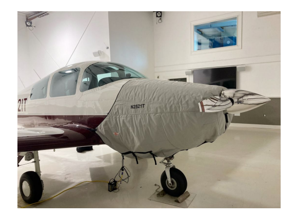
NAVION H Insulated Engine Cover

This cover type is made from Silver Acrylic Sunbrella canvas and is 100% lined with a soft and smooth microfiber. Bruce's Custom Covers developed this material combination especially for aircraft protection. The outer material is medium weight and treated for water resistance, UV resistance and anti-static buildup. The inner lining is a very soft and smooth microfiber to prevent scratching. The material is very reflective, and tests show that the cabin interior temperature can be reduced to near-ambient temperature on the hottest of days. It is water, ice and snow repellent, yet breathable to allow moisture to escape from between the cover and the aircraft surface.