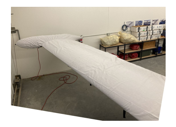
Navion Rangemaster Wing Covers