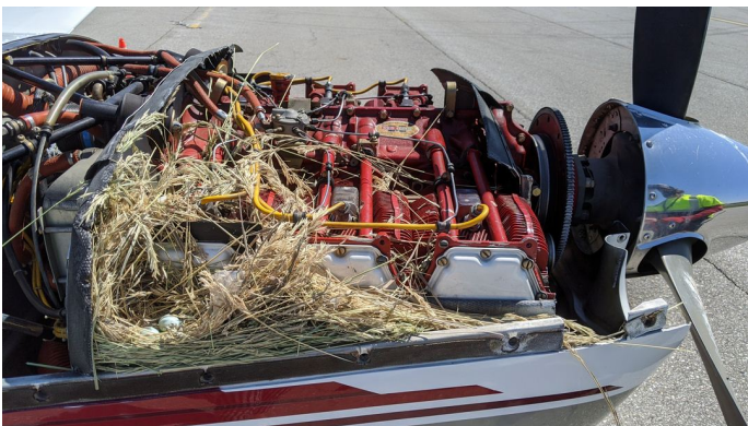
Piper PA-22-150 Engine Inlet Plugs (set of 3) ENGINE PLUGS PREVENT BIRD NEST FOD. Piper Saratoga Engine Cowling Bird's Nest