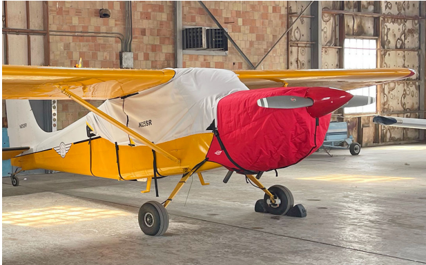
Murphy Super Rebel Insulated Engine Cover