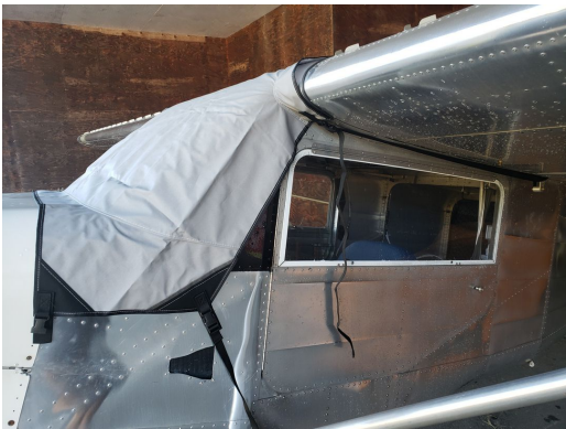
Murphy Rebel, Moose, Renegade, Spirit, Elite, etc. Windshield/Skylight Cover