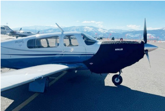
Mooney Bravo Insulated Engine Cover, Fully Enclosed