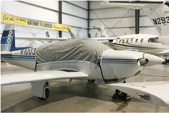
Mooney 201 Travel Cover, Light Weight Travel Canopy Cover, 5 Lbs

occasional use outside. We also have an ultra lightweight material available for fitted hangar dust covers. For daily outdoor use, the non-travel Sunbrella Cover is the best choice.