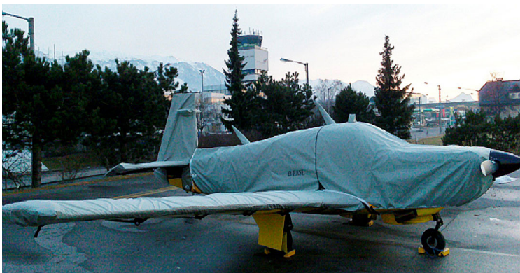
Mooney 231 Extra Extended Canopy/Engine Cover, Wing covers & Empennage Cover