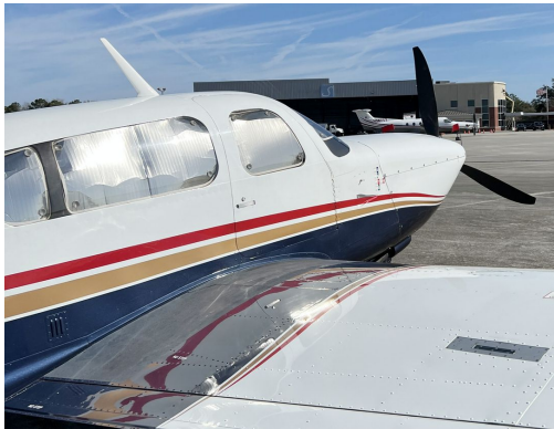
Mooney M20S Heatshield Set

more effective and practical for long-term protection.