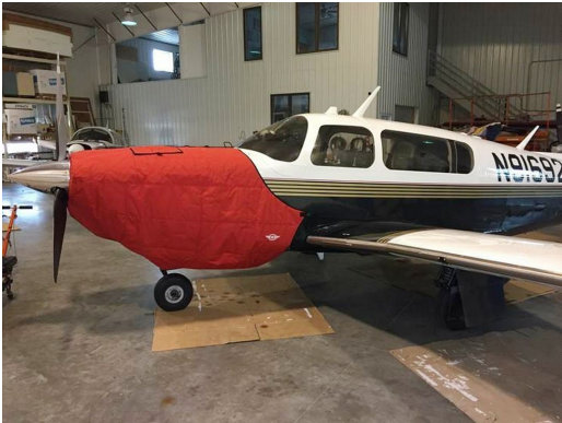
Mooney Ovation Insulated Engine Cover

This cover type is made from Silver Acrylic Sunbrella canvas and is 100% lined with a soft and smooth microfiber. Bruce's Custom Covers developed this material combination especially for aircraft protection. The outer material is medium weight and treated for water resistance, UV resistance and anti-static buildup. The inner lining is a very soft and smooth microfiber to prevent scratching. The material is very reflective, and tests show that the cabin interior temperature can be reduced to near-ambient temperature on the hottest of days. It is water, ice and snow repellent, yet breathable to allow moisture to escape from between the cover and the aircraft surface.