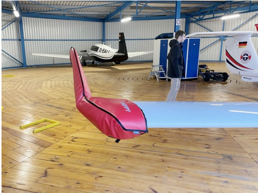
Diamond DA-40 Wingtip Pads

Designed to prevent damage to the aircraft extremities in crowded hangars, these products are made of bright red Naugahyde and thickly padded with a sandwich of closed cell foam.