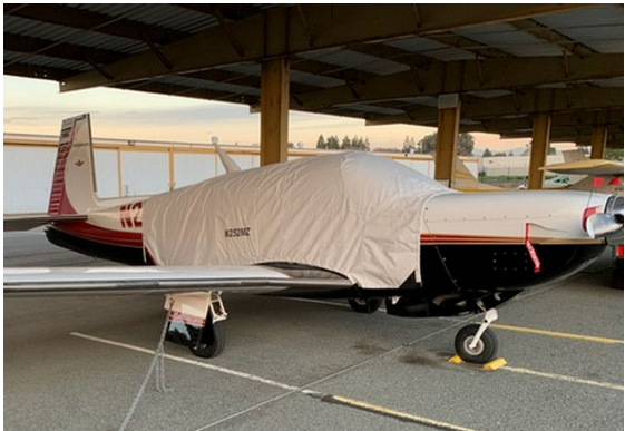
Mooney M20K Extended Canopy Cover