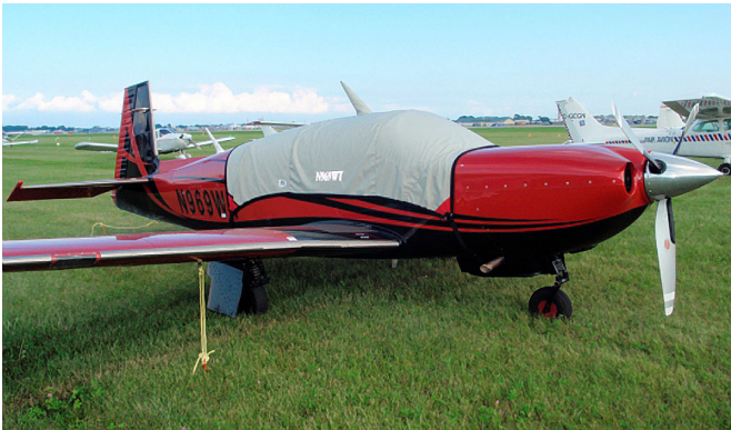
Mooney Acclaim Canopy Cover

This cover type is made from Silver Acrylic Sunbrella canvas and is 100% lined with a soft and smooth microfiber. Bruce's Custom Covers developed this material combination especially for aircraft protection. The outer material is medium weight and treated for water resistance, UV resistance and anti-static buildup. The inner lining is a very soft and smooth microfiber to prevent scratching. The material is very reflective, and tests show that the cabin interior temperature can be reduced to near-ambient temperature on the hottest of days. It is water, ice and snow repellent, yet breathable to allow moisture to escape from between the cover and the aircraft surface.