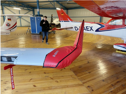
Diamond DA-40 Wingtip Pads