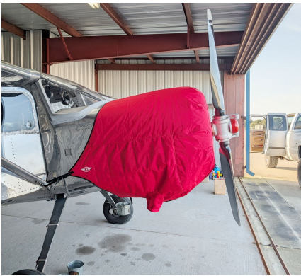
Murphy Moose Insulated Engine Cover

This cover type is made from Silver Acrylic Sunbrella canvas and is 100% lined with a soft and smooth microfiber. Bruce's Custom Covers developed this material combination especially for aircraft protection. The outer material is medium weight and treated for water resistance, UV resistance and anti-static buildup. The inner lining is a very soft and smooth microfiber to prevent scratching. The material is very reflective, and tests show that the cabin interior temperature can be reduced to near-ambient temperature on the hottest of days. It is water, ice and snow repellent, yet breathable to allow moisture to escape from between the cover and the aircraft surface.