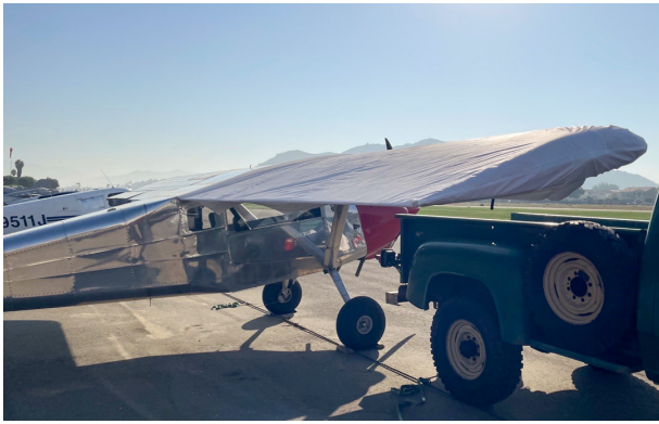
Murphy Elite Wing Covers, test fit cover