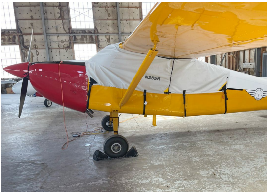
Murphy Super Rebel Canopy Cover