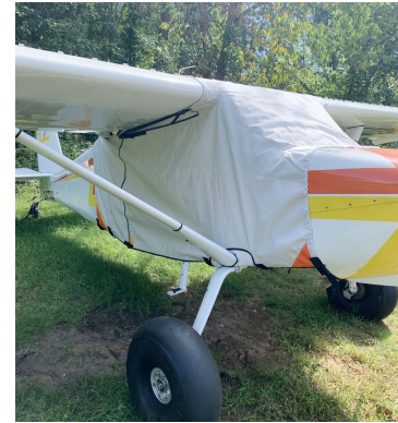
Murphy Elite Over The Top Style Extended Canopy Cover