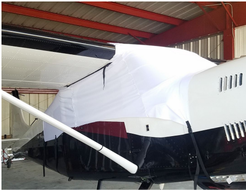
Murphy Moose Canopy Cover (test fit cover)