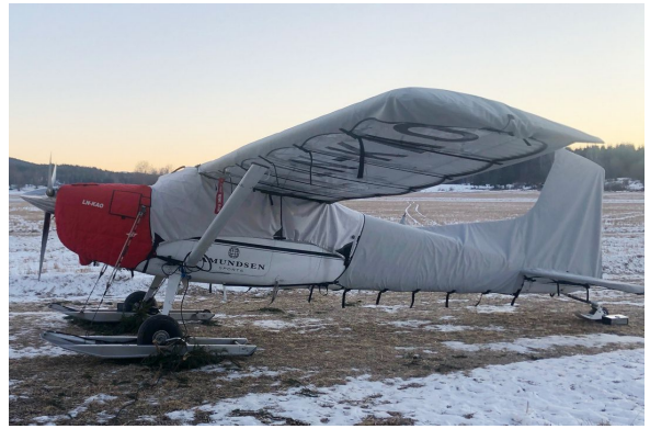
Cessna A185E Winter Cover Set