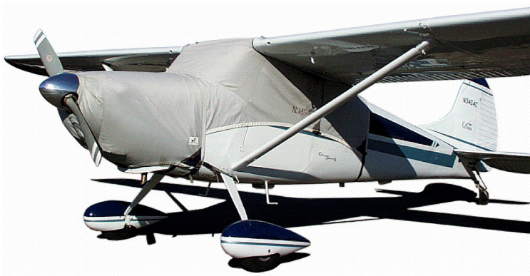
Cessna 170 Canopy Cover & Engine Cover