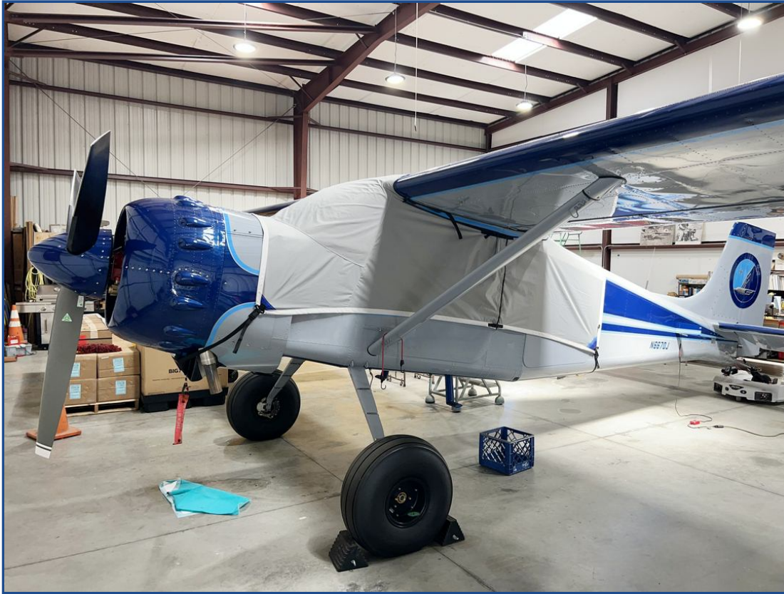
Murphy Moose Travel Weight Canopy Cover