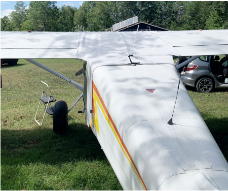
Murphy Elite Over The Top Style Extended Canopy Cover

This cover type is made from Silver Acrylic Sunbrella canvas and is 100% lined with a soft and smooth microfiber. Bruce's Custom Covers developed this material combination especially for aircraft protection. The outer material is medium weight and treated for water resistance, UV resistance and anti-static buildup. The inner lining is a very soft and smooth microfiber to prevent scratching. The material is very reflective, and tests show that the cabin interior temperature can be reduced to near-ambient temperature on the hottest of days. It is water, ice and snow repellent, yet breathable to allow moisture to escape from between the cover and the aircraft surface.