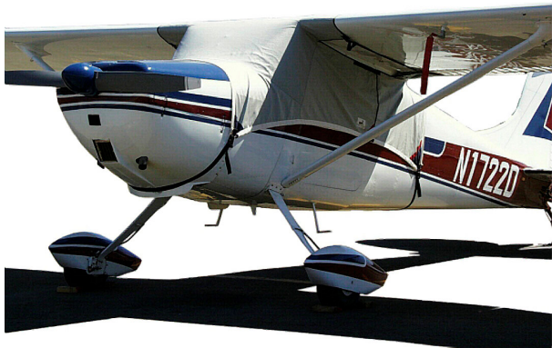
Over-the-Top Canopy Cover

Covers developed this material combination especially for aircraft protection. The outer material is medium weight and treated for water resistance, UV resistance and anti-static buildup. The inner lining is a very soft and smooth microfiber to prevent scratching. The material is very reflective, and tests show that the cabin interior temperature can be reduced to near-ambient temperature on the hottest of days. It is water, ice and snow repellent, yet breathable to allow moisture to escape from between the cover and the aircraft surface.