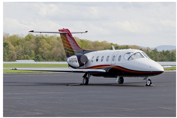
Nextant 400XTi Cockpit HeatShields, Bikini Type Engine Covers