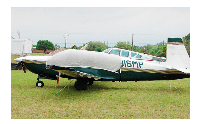
Mooney Ovation Canopy Cover