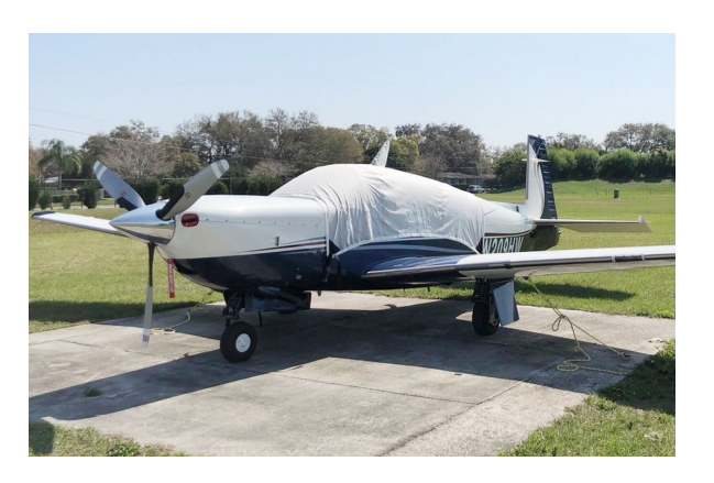
Mooney Ovation Canopy Cover