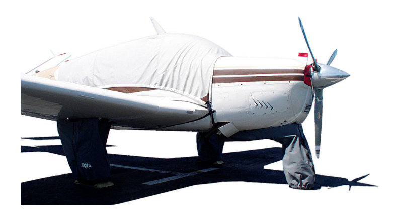
Beech Bonanza/Debonair/Baron Landing Gear Covers