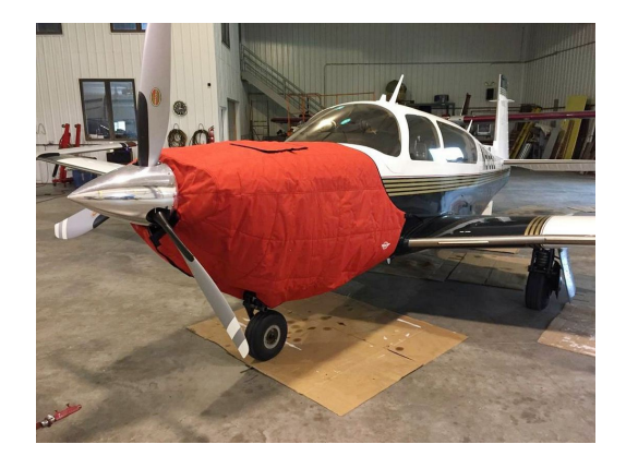
Mooney Ovation Insulated Engine Cover