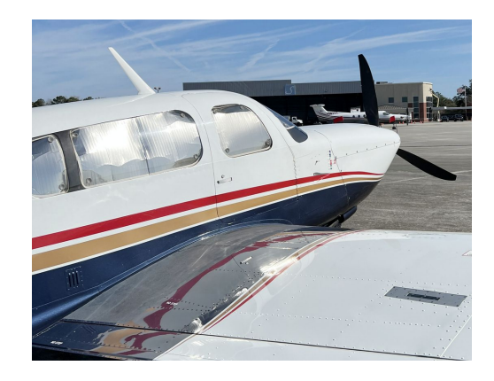
Mooney M20S Heatshield Set

Heatshields are interior sunshades for an aircraft's windows or canopy glass. The product is a unique composite of closed-cell foam with a silver mylar finish. The semi-rigid design is stiff enough to stand along the inside of the windshield using sun visors or window framing. It folds up flat and easily stores in the included storage sleeve. Some designs may require velcro and suction cups. A Heatshield is an excellent short-term remedy for cockpit overheating.