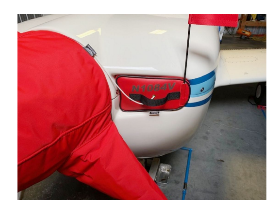
Mooney Engine Inlet Plug & Prop Cover

This cover type is made from Silver Acrylic Sunbrella canvas and is 100% lined with a soft and smooth microfiber. Bruce's Custom Covers developed this material combination especially for aircraft protection. The outer material is medium weight and treated for water resistance, UV resistance and anti-static buildup. The inner lining is a very soft and smooth microfiber to prevent scratching. The material is very reflective, and tests show that the cabin interior temperature can be reduced to near-ambient temperature on the hottest of days. It is water, ice and snow repellent, yet breathable to allow moisture to escape from between the cover and the aircraft surface.