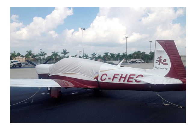
Mooney TLS Canopy Cover

Travel Covers are made with Silver Solution-Dyed Polyester fabric and only lined over the windshield to save weight. The material is lightweight and more compact for easy stowage in the aircraft. The polyester material is water resistant, but only intended for occasional use outside. We also have an ultra lightweight material available for fitted hangar dust covers. For daily outdoor use, the non-travel Sunbrella Cover is the best choice.