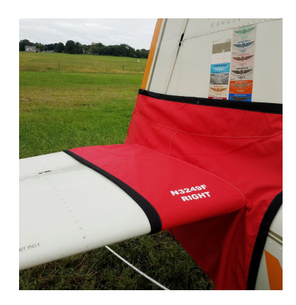
Mooney M20E Tailcone Cover

WINTER USE MATERIAL - Made with Solution-Dyed Polyester fabric, this option is intended for seasonal use to aid in deicing, rain mitigation, or for occasional travel. The material is lighter and more compact, but more susceptible to UV damage and may have a shorter useful life if used continuously outside than the all-year use material.