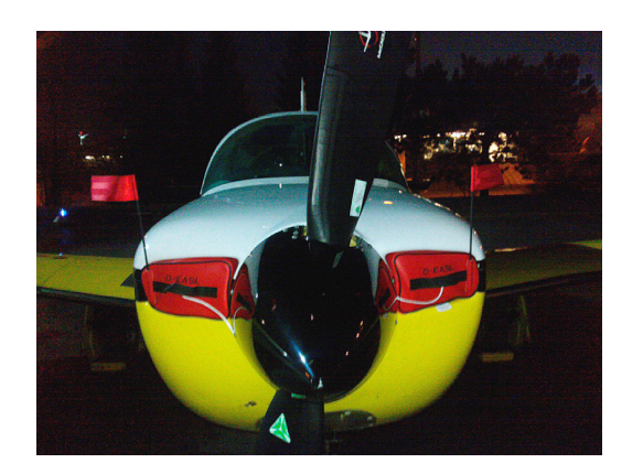
Mooney 231 Engine Inlet Plugs