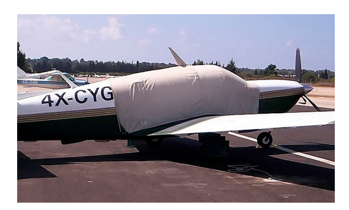
Mooney M20 Extended Canopy Cover

This cover type is made from Silver Acrylic Sunbrella canvas and is 100% lined with a soft and smooth microfiber. Bruce's Custom Covers developed this material combination especially for aircraft protection. The outer material is medium weight and treated for water resistance, UV resistance and anti-static buildup. The inner lining is a very soft and smooth microfiber to prevent scratching. The material is very reflective, and tests show that the cabin interior temperature can be reduced to near-ambient temperature on the hottest of days. It is water, ice and snow repellent, yet breathable to allow moisture to escape from between the cover and the aircraft surface.