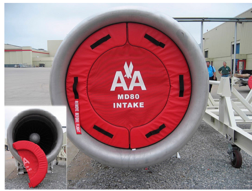
MD-80 JT8D Intake Plug, mesh center & folding type