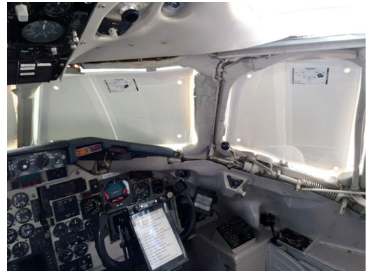
McDonnell Douglas MD80 Cockpit Heatshield Set