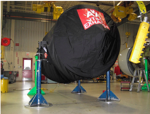
PW JT8D Off-Link Engine Transport Cover (no nose cone, no TR's), fully enclosed

material, and stuffed with a single block of sculpted urethane foam. Each plug has a zipper that allows the foam to be removed and dried if necessary. Engine plugs have 'remove before flight' streamers sewn onto the face of the plugs. Most plugs are imprinted with the aircraft registration number in black for an extra charge. Storage bag NOT included. Engine plugs may be inserted after flight when the engine is still warm. Engine Inlet Plugs are commonly referred to as Cowl Plugs, Intake Plugs, Cowl Blocks, Engine Blocks, and Engine Bungs.