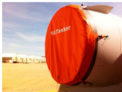
DC-10-30 Intake Cover (CF650C2 Engine)