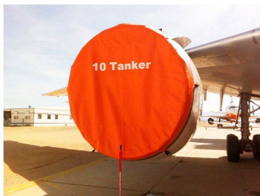
DC-10 Intake Cover