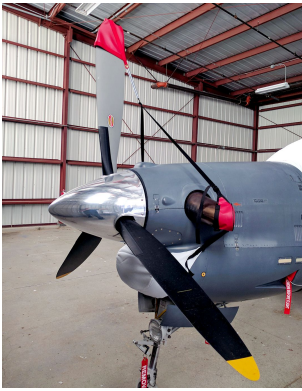
Embraer EMB 312 Tucano Prop Tie Down/Exhaust Covers