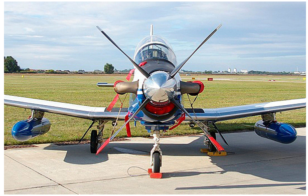
Texan II T6A Engine Inlet Plug, Prop Tie/Exhaust Covers