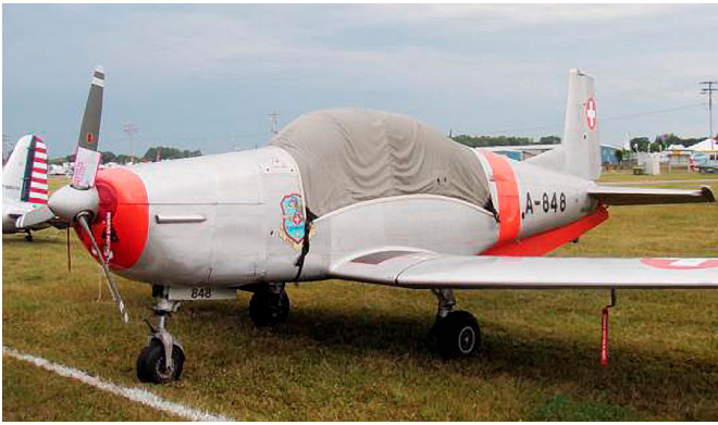
Pilatus P-3 Canopy Cover