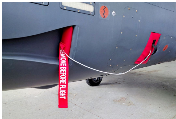
Embraer EMB 312 Tucano Side Naca Plugs