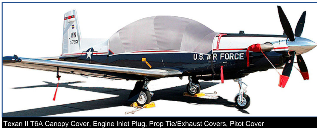
Texan II T6A Canopy Cover, Engine Inlet Plug, Prop Tie/Exhaust Covers, Pitot Cover