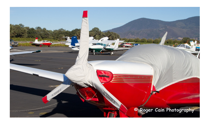
Mooney M20M Bravo 3-Blade Prop Cover, Engine Plugs

Engine Inlet Plugs are custom fit for your Mooney Mustang intakes, made with heavy-duty vinyl material, and stuffed with a single block of sculpted urethane foam. Each plug has a zipper that allows the foam to be removed and dried if necessary. Engine plugs have warning flags that are visible from the cockpit or 'remove before flight' streamers sewn onto the face of the plugs. Most plugs are imprinted with the aircraft registration number in black for an extra charge. Storage bag NOT included. Engine plugs may be inserted after flight when the engine is still warm. Engine Inlet Plugs are commonly referred to as Cowl Plugs, Intake Plugs, Cowl Blocks, Engine Blocks, and Engine Bungs.