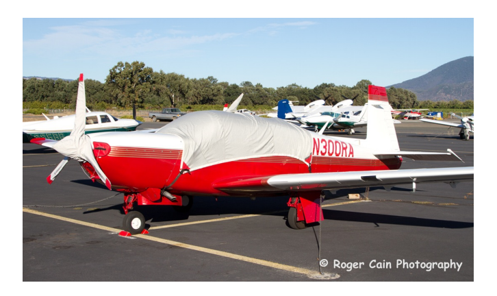
Mooney M20M Bravo Canopy Cover, 3-Blade Prop Cover