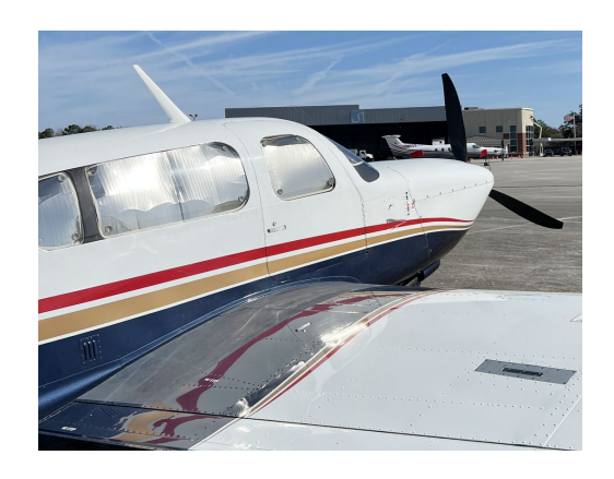
Mooney M20S Heatshield Set