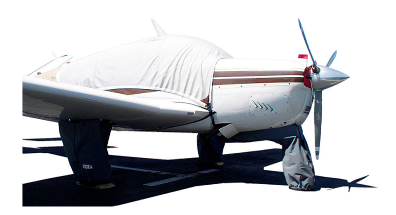
Beech Bonanza/Debonair/Baron Landing Gear Covers