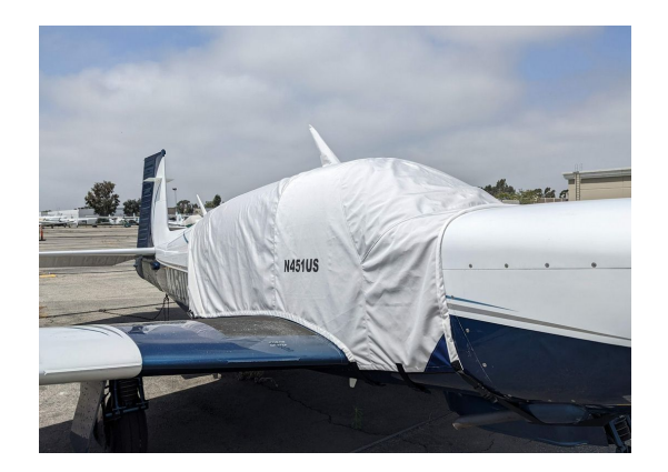
Mooney Ovation Extended Canopy Cover

This cover type is made from Silver Acrylic Sunbrella canvas and is 100% lined with a soft and smooth microfiber. Bruce's Custom Covers developed this material combination especially for aircraft protection. The outer material is medium weight and treated for water resistance, UV resistance and anti-static buildup. The inner lining is a very soft and smooth microfiber to prevent scratching. The material is very reflective, and tests show that the cabin interior temperature can be reduced to near-ambient temperature on the hottest of days. It is water, ice and snow repellent, yet breathable to allow moisture to escape from between the cover and the aircraft surface.