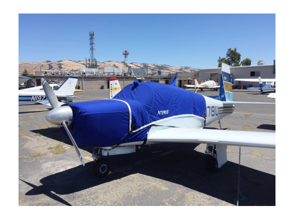
Mooney M20 Canopy & Engine Cover