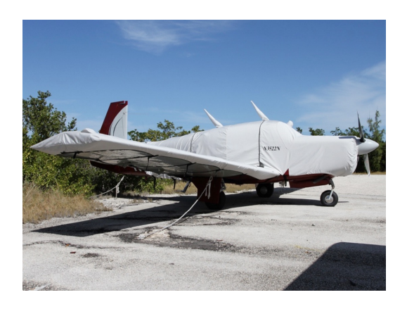
Mooney M20C Extended Canopy/Engine & Wing Covers