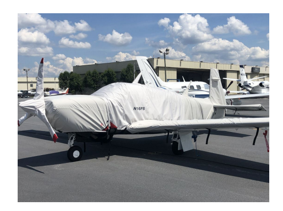
Mooney M20TN Acclaim Full Cover Set

This cover type is made from Silver Acrylic Sunbrella canvas and is 100% lined with a soft and smooth microfiber. Bruce's Custom Covers developed this material combination especially for aircraft protection. The outer material is medium weight and treated for water resistance, UV resistance and anti-static buildup. The inner lining is a very soft and smooth microfiber to prevent scratching. The material is very reflective, and tests show that the cabin interior temperature can be reduced to near-ambient temperature on the hottest of days. It is water, ice and snow repellent, yet breathable to allow moisture to escape from between the cover and the aircraft surface.