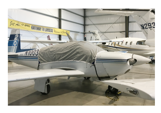
Mooney 201 Travel Cover, Light Weight Travel Canopy Cover, 5 Lbs