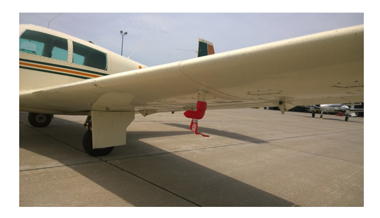
Mooney Pitot Cover

Engine Inlet Plugs are custom fit for your Mooney M20V Acclaim Ultra intakes, made with heavy-duty vinyl material, and stuffed with a single block of sculpted urethane foam. Each plug has a zipper that allows the foam to be removed and dried if necessary. Engine plugs have warning flags that are visible from the cockpit or 'remove before flight' streamers sewn onto the face of the plugs. Most plugs are imprinted with the aircraft registration number in black for an extra charge. Storage bag NOT included. Engine plugs may be inserted after flight when the engine is still warm. Engine Inlet Plugs are commonly referred to as Cowl Plugs, Intake Plugs, Cowl Blocks, Engine Blocks, and Engine Bungs.