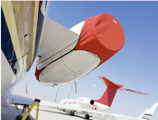
Embraer ERJ-135/140/145 Legacy 650 3-Strap Intake/Exhaust Cover