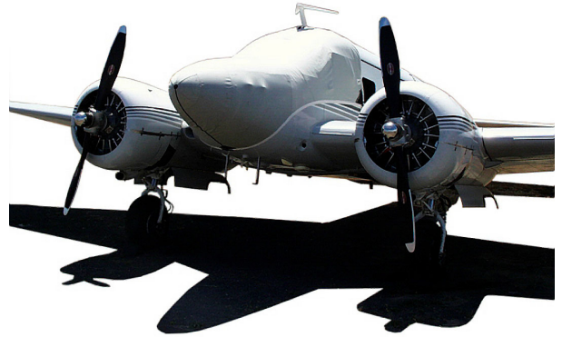
Beech 18 Cockpit/Nose Cover