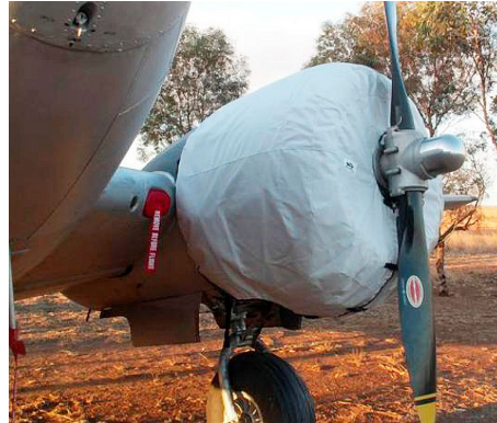
Beech D-18 Engine Covers, Center Section Oil Cooler Inlet Plugs, and Pitot Covers

This cover type is made from Silver Acrylic Sunbrella canvas and is 100% lined with a soft and smooth microfiber. Bruce's Custom Covers developed this material combination especially for aircraft protection. The outer material is medium weight and treated for water resistance, UV resistance and anti-static buildup. The inner lining is a very soft and smooth microfiber to prevent scratching. The material is very reflective, and tests show that the cabin interior temperature can be reduced to near-ambient temperature on the hottest of days. It is water, ice and snow repellent, yet breathable to allow moisture to escape from between the cover and the aircraft surface.