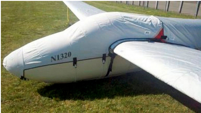
Schweizer SGS 1-26B Canopy/Nose, Wings & Empennage Covers

This cover type is made from Silver Acrylic Sunbrella canvas and is 100% lined with a soft and smooth microfiber. Bruce's Custom Covers developed this material combination especially for aircraft protection. The outer material is medium weight and treated for water resistance, UV resistance and anti-static buildup. The inner lining is a very soft and smooth microfiber to prevent scratching. The material is very reflective, and tests show that the cabin interior temperature can be reduced to near-ambient temperature on the hottest of days. It is water, ice and snow repellent, yet breathable to allow moisture to escape from between the cover and the aircraft surface.