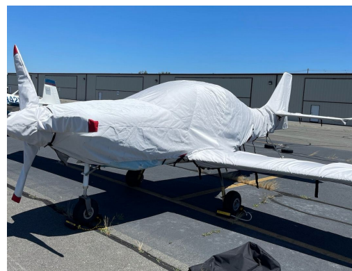
Lancair IV Complete Cover Set