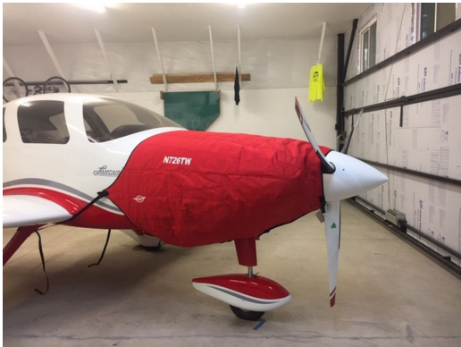
Lancair ES Insulated Engine Cover, Fully Enclosed