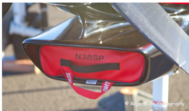
Lancair Evolution Engine Inlet Plug

Engine Inlet Plugs are custom fit for your Lancair IV, LX7 intakes, made with heavy-duty vinyl material, and stuffed with a single block of sculpted urethane foam. Each plug has a zipper that allows the foam to be removed and dried if necessary. Engine plugs have warning flags that are visible from the cockpit or 'remove before flight' streamers sewn onto the face of the plugs. Most plugs are imprinted with the aircraft registration number in black for an extra charge. Storage bag NOT included. Engine plugs may be inserted after flight when the engine is still warm. Engine Inlet Plugs are commonly referred to as Cowl Plugs, Intake Plugs, Cowl Blocks, Engine Blocks, and Engine Bungs.