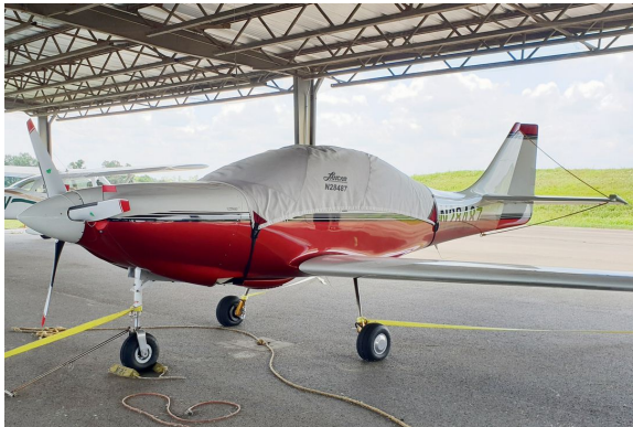
Lancair VI-P Canopy Cover & Engine Plugs