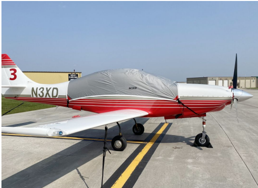
Lancair IV Travel Weight Canopy Cover

Travel Covers are made with Silver Solution-Dyed Polyester fabric and only lined over the windshield to save weight. The material is lightweight and more compact for easy stowage in the aircraft. The polyester material is water resistant, but only intended for occasional use outside. We also have an ultra lightweight material available for fitted hangar dust covers. For daily outdoor use, the non-travel Sunbrella Cover is the best choice.