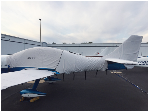
Lancair ES Wing Covers & Empennage Cover (sold separately)

This cover type is made from Silver Acrylic Sunbrella canvas and is 100% lined with a soft and smooth microfiber. Bruce's Custom Covers developed this material combination especially for aircraft protection. The outer material is medium weight and treated for water resistance, UV resistance and anti-static buildup. The inner lining is a very soft and smooth microfiber to prevent scratching. The material is very reflective, and tests show that the cabin interior temperature can be reduced to near-ambient temperature on the hottest of days. It is water, ice and snow repellent, yet breathable to allow moisture to escape from between the cover and the aircraft surface.