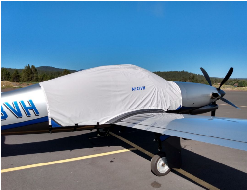
Lancair Evolution Extended Canopy Cover

This cover type is made from Silver Acrylic Sunbrella canvas and is 100% lined with a soft and smooth microfiber. Bruce's Custom Covers developed this material combination especially for aircraft protection. The outer material is medium weight and treated for water resistance, UV resistance and anti-static buildup. The inner lining is a very soft and smooth microfiber to prevent scratching. The material is very reflective, and tests show that the cabin interior temperature can be reduced to near-ambient temperature on the hottest of days. It is water, ice and snow repellent, yet breathable to allow moisture to escape from between the cover and the aircraft surface.