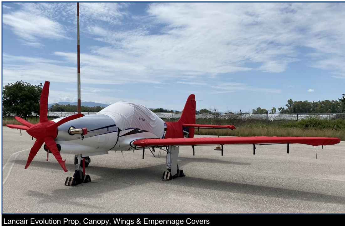
Lancair Evolution Prop, Canopy, Wings &amp; Empennage Covers