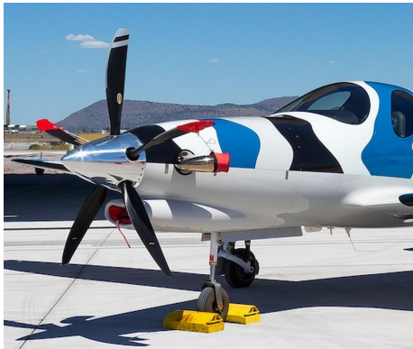
Lancair Evolution Prop Tie/Exhaust Covers, Inlet Plug