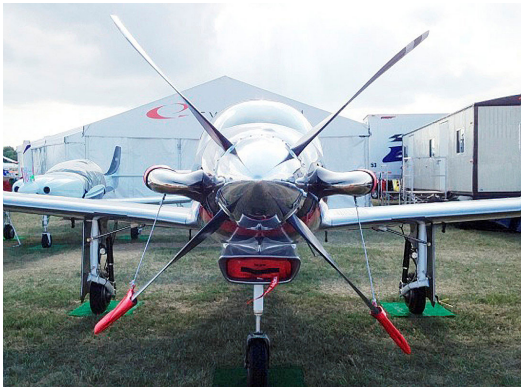
Lancair Evolution Prop Tie-Exhaust Covers

Engine Inlet Plugs are custom fit for your Lancair Evolution intakes, made with heavy-duty vinyl material, and stuffed with a single block of sculpted urethane foam. Each plug has a zipper that allows the foam to be removed and dried if necessary. Engine plugs have warning flags that are visible from the cockpit or 'remove before flight' streamers sewn onto the face of the plugs. Most plugs are imprinted with the aircraft registration number in black for an extra charge. Storage bag NOT included. Engine plugs may be inserted after flight when the engine is still warm. Engine Inlet Plugs are commonly referred to as Cowl Plugs, Intake Plugs, Cowl Blocks, Engine Blocks, and Engine Bungs.