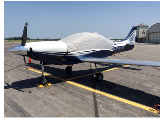
Lancair IV Light Weight Travel Canopy Cover