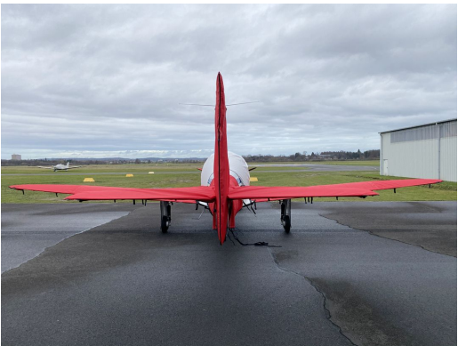
Lancair Evolution Wing & Empennage Covers, Insulated Engine & Prop Covers Lancair Evolution Empennage & Wing Covers