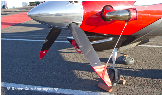
Lancair Evolution Prop Tie/Exhaust Covers