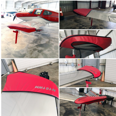
Cirrus SR22 Wingtip Pads, G5 Models

Designed to prevent damage to the aircraft extremities in crowded hangars, these products are made of bright red Naugahyde and thickly padded with a sandwich of closed cell foam.