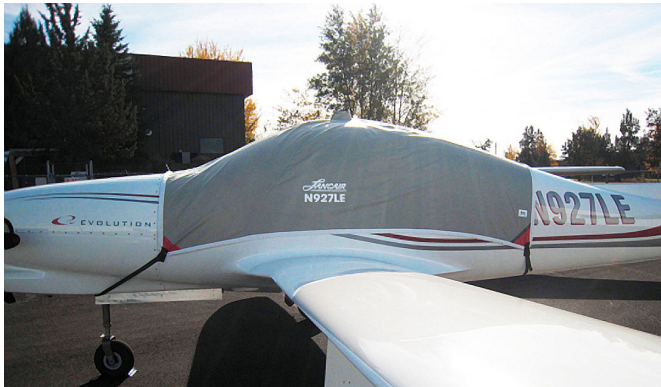
Lancair Evolution Canopy Cover