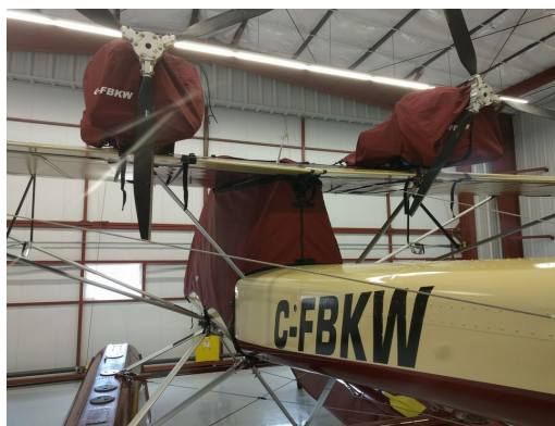
Lockwood Air Cam Canopy Cover, enclosed cockpit style, & Engine Covers