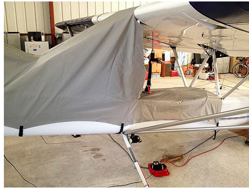
Lockwood AirCam Lightweight Travel Canopy/Nose Cover w/ aft baggage compartment ext