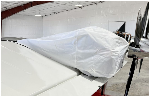
Lockwood Air Cam Engine Cover, test fit cover