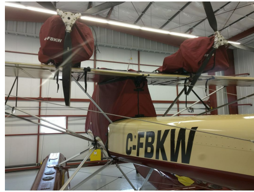
Lockwood Air Cam Canopy Cover, enclosed cockpit style, & Engine Covers