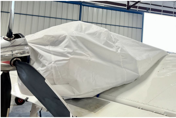
Lockwood Air Cam Engine Cover, test fit cover