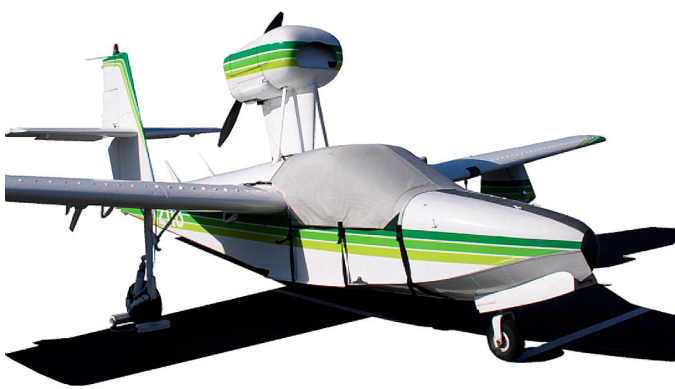
Lake LA-250 Canopy Cover