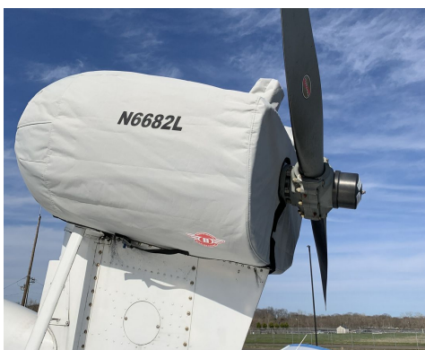
Lake LA-4 Buccaneer Insulated Engine Cover

This cover type is made from Silver Acrylic Sunbrella canvas and is 100% lined with a soft and smooth microfiber. Bruce's Custom Covers developed this material combination especially for aircraft protection. The outer material is medium weight and treated for water resistance, UV resistance and anti-static buildup. The inner lining is a very soft and smooth microfiber to prevent scratching. The material is very reflective, and tests show that the cabin interior temperature can be reduced to near-ambient temperature on the hottest of days. It is water, ice and snow repellent, yet breathable to allow moisture to escape from between the cover and the aircraft surface.