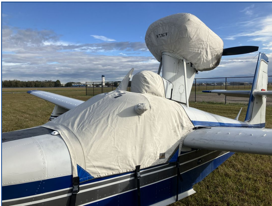
Lake LA-4 Canopy/Heater Box Cover, Engine Cover