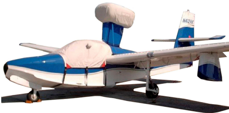
Lake Canopy & Engine Covers

Travel Covers are made with Silver Solution-Dyed Polyester fabric and only lined over the windshield to save weight. The material is lightweight and more compact for easy stowage in the aircraft. The polyester material is water resistant, but only intended for occasional use outside. We also have an ultra lightweight material available for fitted hangar dust covers. For daily outdoor use, the non-travel Sunbrella Cover is the best choice.