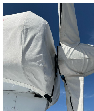
Lake LA-4-200 Engine & Prop Covers