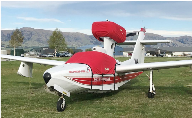
Lake Renegade Cabin & Engine Covers