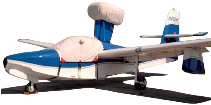
Lake Canopy & Engine Covers