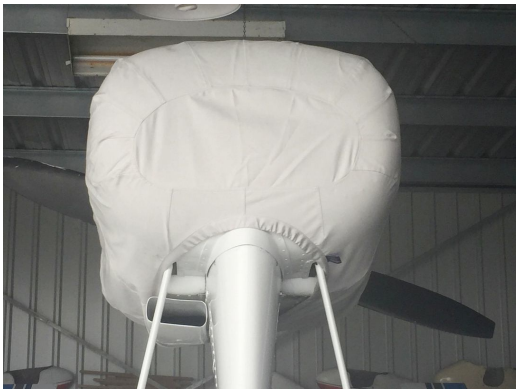
Lake LA-4 Buccaneer Engine Cover