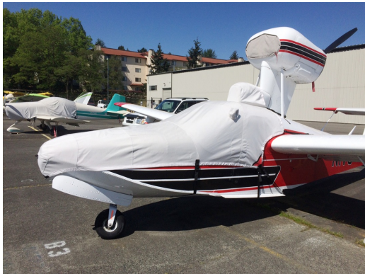
Lake LA-4 Canopy/Nose Cover

This cover type is made from Silver Acrylic Sunbrella canvas and is 100% lined with a soft and smooth microfiber. Bruce's Custom Covers developed this material combination especially for aircraft protection. The outer material is medium weight and treated for water resistance, UV resistance and anti-static buildup. The inner lining is a very soft and smooth microfiber to prevent scratching. The material is very reflective, and tests show that the cabin interior temperature can be reduced to near-ambient temperature on the hottest of days. It is water, ice and snow repellent, yet breathable to allow moisture to escape from between the cover and the aircraft surface.