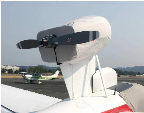
Lake LA-4 Buccaneer Engine Cover

This cover type is made from Silver Acrylic Sunbrella canvas and is 100% lined with a soft and smooth microfiber. Bruce's Custom Covers developed this material combination especially for aircraft protection. The outer material is medium weight and treated for water resistance, UV resistance and anti-static buildup. The inner lining is a very soft and smooth microfiber to prevent scratching. The material is very reflective, and tests show that the cabin interior temperature can be reduced to near-ambient temperature on the hottest of days. It is water, ice and snow repellent, yet breathable to allow moisture to escape from between the cover and the aircraft surface.