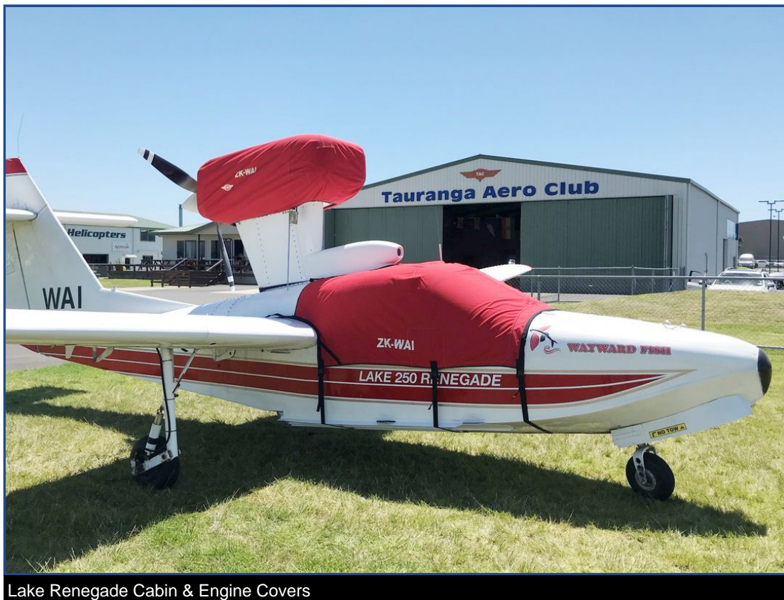
Lake Renegade Cabin &amp; Engine Covers