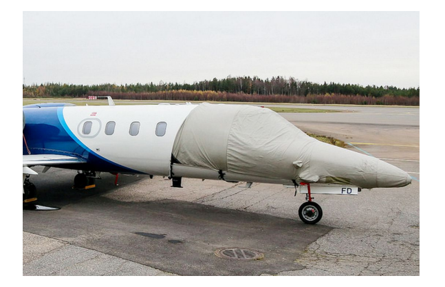
Learjet Cockpit/Nose Cover

This cover type is made from Silver Acrylic Sunbrella canvas and is 100% lined with a soft and smooth microfiber. Bruce's Custom Covers developed this material combination especially for aircraft protection. The outer material is medium weight and treated for water resistance, UV resistance and anti-static buildup. The inner lining is a very soft and smooth microfiber to prevent scratching. The material is very reflective, and tests show that the cabin interior temperature can be reduced to near-ambient temperature on the hottest of days. It is water, ice and snow repellent, yet breathable to allow moisture to escape from between the cover and the aircraft surface.