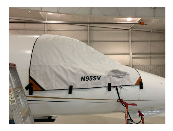
Lear 70 Cockpit Cover