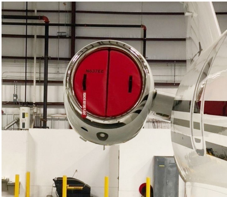
Embraer Legacy 500 Engine Inlet Plugs, folding type

The Engine Inlet Plugs are custom fit for your Embraer Legacy 500 Praetor, (EMB-545/550) intakes, made with heavy-duty vinyl material, and stuffed with a single block of sculpted urethane foam. Each plug has a zipper that allows the foam to be removed and dried if necessary. Engine plugs have 'remove before flight' streamers sewn onto the face of the plugs. Most plugs are imprinted with the aircraft registration number in black for an extra charge. Storage bag NOT included. Engine plugs may be inserted after flight when the engine is still warm. Engine Inlet Plugs are commonly referred to as Cowl Plugs, Intake Plugs, Cowl Blocks, Engine Blocks, and Engine Bungs.