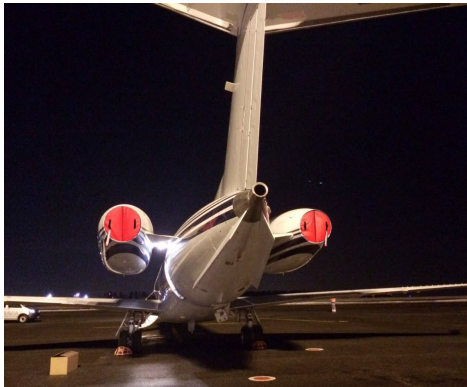
Embraer Legacy Exhaust Plugs