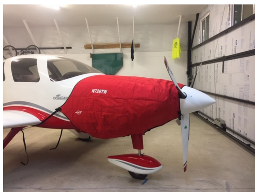
Lancair ES Insulated Engine Cover, Fully Enclosed

This cover type is made from Silver Acrylic Sunbrella canvas and is 100% lined with a soft and smooth microfiber. Bruce's Custom Covers developed this material combination especially for aircraft protection. The outer material is medium weight and treated for water resistance, UV resistance and anti-static buildup. The inner lining is a very soft and smooth microfiber to prevent scratching. The material is very reflective, and tests show that the cabin interior temperature can be reduced to near-ambient temperature on the hottest of days. It is water, ice and snow repellent, yet breathable to allow moisture to escape from between the cover and the aircraft surface.