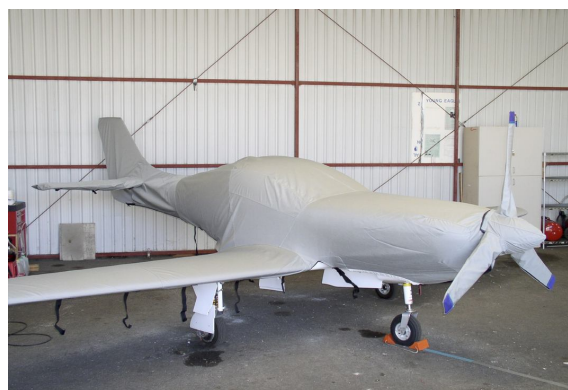
Lancair 360 Complete Cover