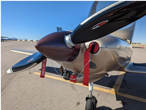
Lancair 320 Engine Inlet Plugs

Engine Inlet Plugs are custom fit for your Lancair Models 320, 360 intakes, made with heavy-duty vinyl material, and stuffed with a single block of sculpted urethane foam. Each plug has a zipper that allows the foam to be removed and dried if necessary. Engine plugs have warning flags that are visible from the cockpit or 'remove before flight' streamers sewn onto the face of the plugs. Most plugs are imprinted with the aircraft registration number in black for an extra charge. Storage bag NOT included. Engine plugs may be inserted after flight when the engine is still warm. Engine Inlet Plugs are commonly referred to as Cowl Plugs, Intake Plugs, Cowl Blocks, Engine Blocks, and Engine Bungs.