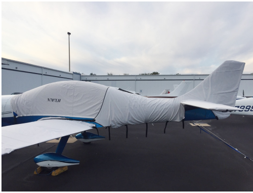
Lancair ES Wing Covers & Empennage Cover (sold separately)