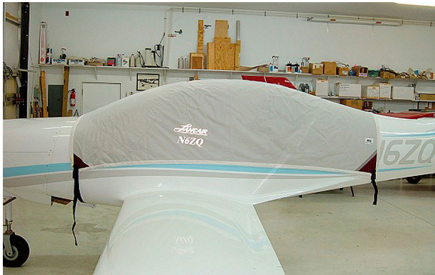
Lancair 320 Standard Canopy Cover

This cover type is made from Silver Acrylic Sunbrella canvas and is 100% lined with a soft and smooth microfiber. Bruce's Custom Covers developed this material combination especially for aircraft protection. The outer material is medium weight and treated for water resistance, UV resistance and anti-static buildup. The inner lining is a very soft and smooth microfiber to prevent scratching. The material is very reflective, and tests show that the cabin interior temperature can be reduced to near-ambient temperature on the hottest of days. It is water, ice and snow repellent, yet breathable to allow moisture to escape from between the cover and the aircraft surface.