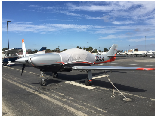
Lancair Legacy 2000 Travel Canopy Cover