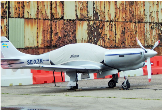
Lancair 320/360 Canopy Cover