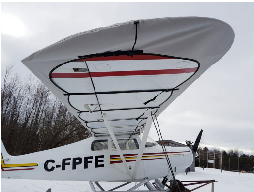
Christavia Mk 1 Wing Covers

WINTER USE MATERIAL - Made with Solution-Dyed Polyester fabric, this option is intended for seasonal use to aid in deicing, rain mitigation, or for occasional travel. The material is lighter and more compact, but more susceptible to UV damage and may have a shorter useful life if used continuously outside than the all-year use material.