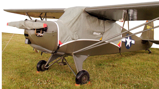
L3 Canopy Cover &amp; Prop Cover

This cover type is made from Silver Acrylic Sunbrella canvas and is 100% lined with a soft and smooth microfiber. Bruce's Custom Covers developed this material combination especially for aircraft protection. The outer material is medium weight and treated for water resistance, UV resistance and anti-static buildup. The inner lining is a very soft and smooth microfiber to prevent scratching. The material is very reflective, and tests show that the cabin interior temperature can be reduced to near-ambient temperature on the hottest of days. It is water, ice and snow repellent, yet breathable to allow moisture to escape from between the cover and the aircraft surface.