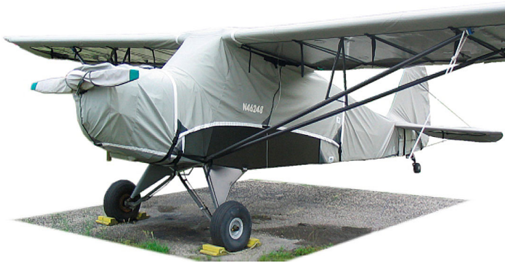
Prop Cover, Engine Cover, Canopy Cover, Wing Covers and Empennage Cover