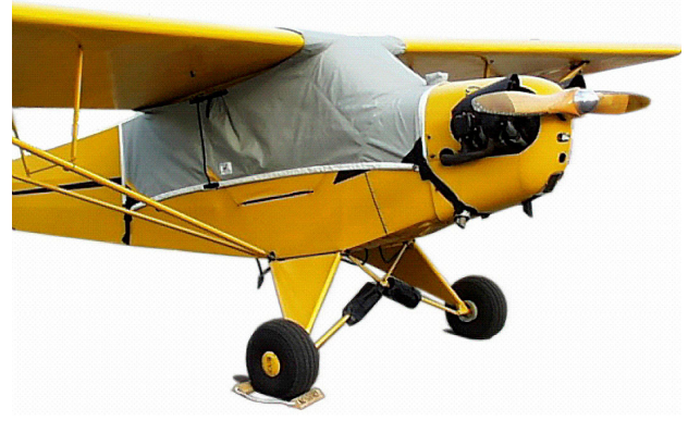
Piper J3 Canopy Cover