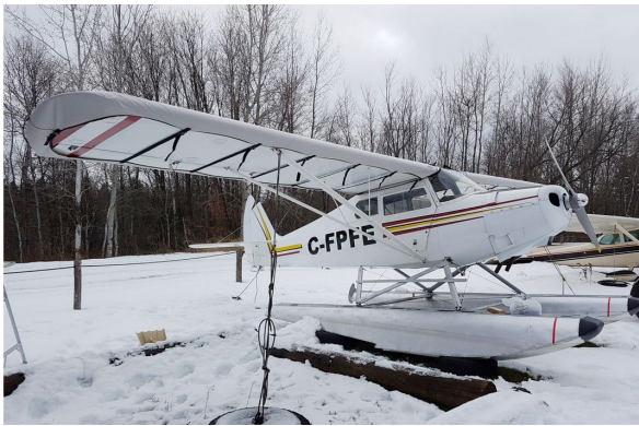
Christavia Mk 1 Wing Covers