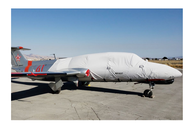
Aero L-29 Extended Canopy/Nose Cover, Engine Plugs