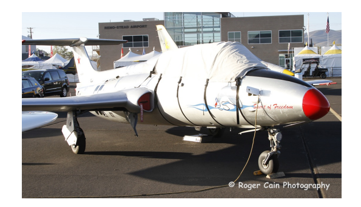
Aero L-29 Canopy Cover, Engine Plugs