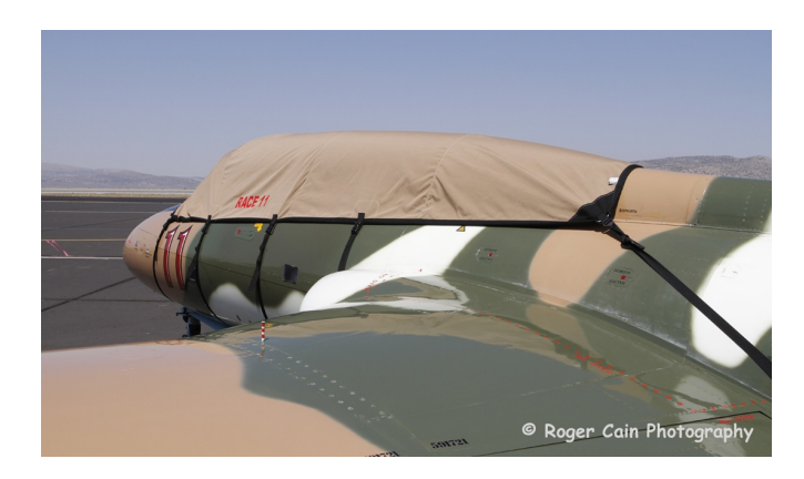
Aero L-29 Canopy Cover

Travel Covers are made with Silver Solution-Dyed Polyester fabric and only lined over the windshield to save weight. The material is lightweight and more compact for easy stowage in the aircraft. The polyester material is water resistant, but only intended for occasional use outside. We also have an ultra lightweight material available for fitted hangar dust covers. For daily outdoor use, the non-travel Sunbrella Cover is the best choice.