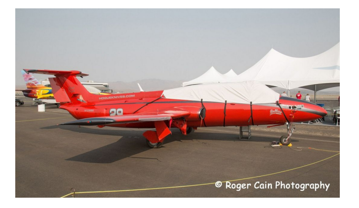
Aero L-29 Canopy Cover