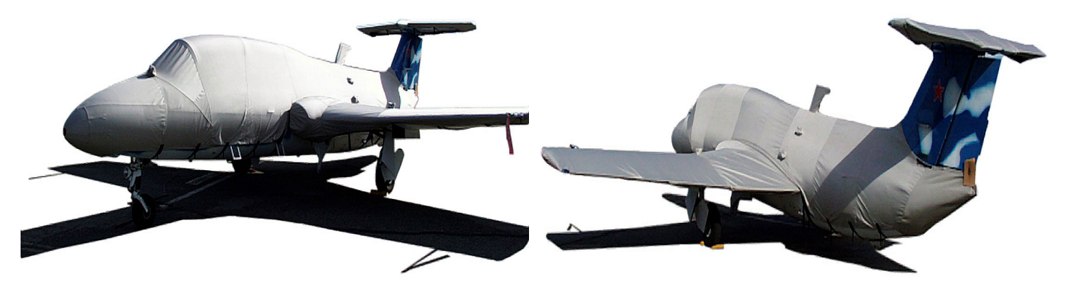
Fuselage, Wings & Horizontal Stabilizer Cover

mitigation, or for occasional travel. The material is lighter and more compact, but more susceptible to UV damage and may have a shorter useful life if used continuously outside than the all-year use material.